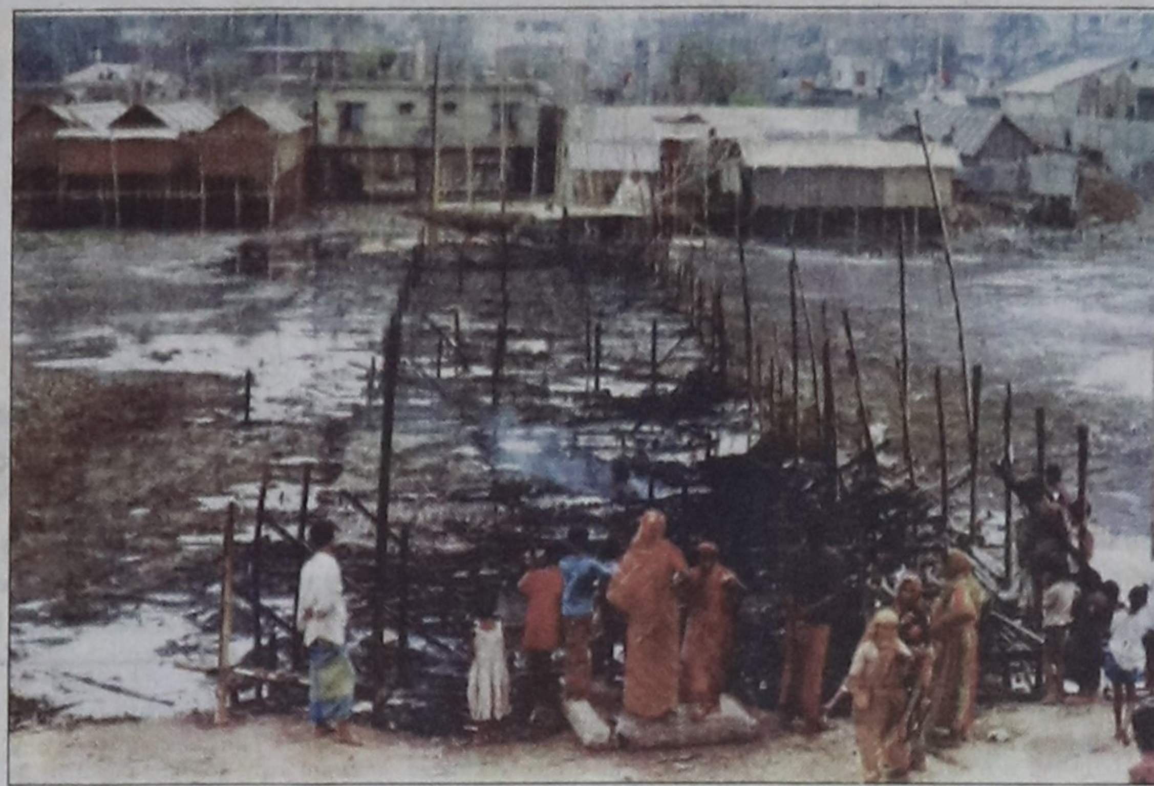
About 20 shanties were gutted in a fire that broke out at a slum on Bou Bazar embankment in city's Rayer Bazar area yesterday morning.