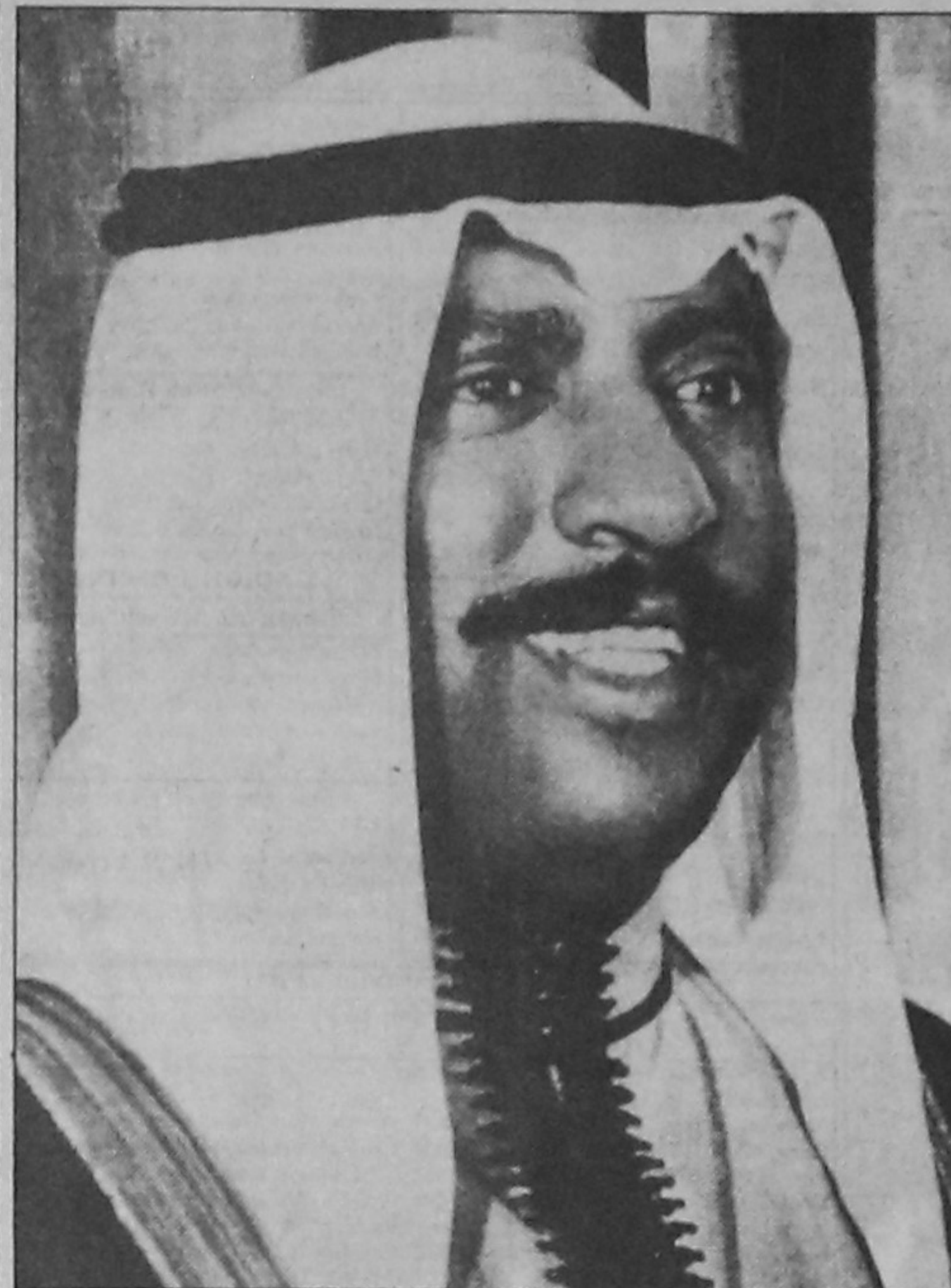
HHI Sheikh Saad Al-Abdallah Al-Salem Al-Sabah Crown Prince and Prime Minister of Kuwait