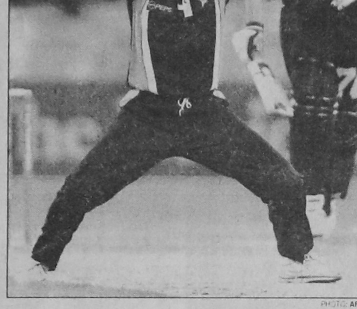
Pakistani all-rounder Azhar Mahmood makes an unsuccessful appeal for a leg before decision against James Franklin during the third one-day international in Wellington yesterday.

NEW ZEALAND Fleming lbw b Akram 1 Astle lbw b Akram 10 Twose c Moin b Waqar 1