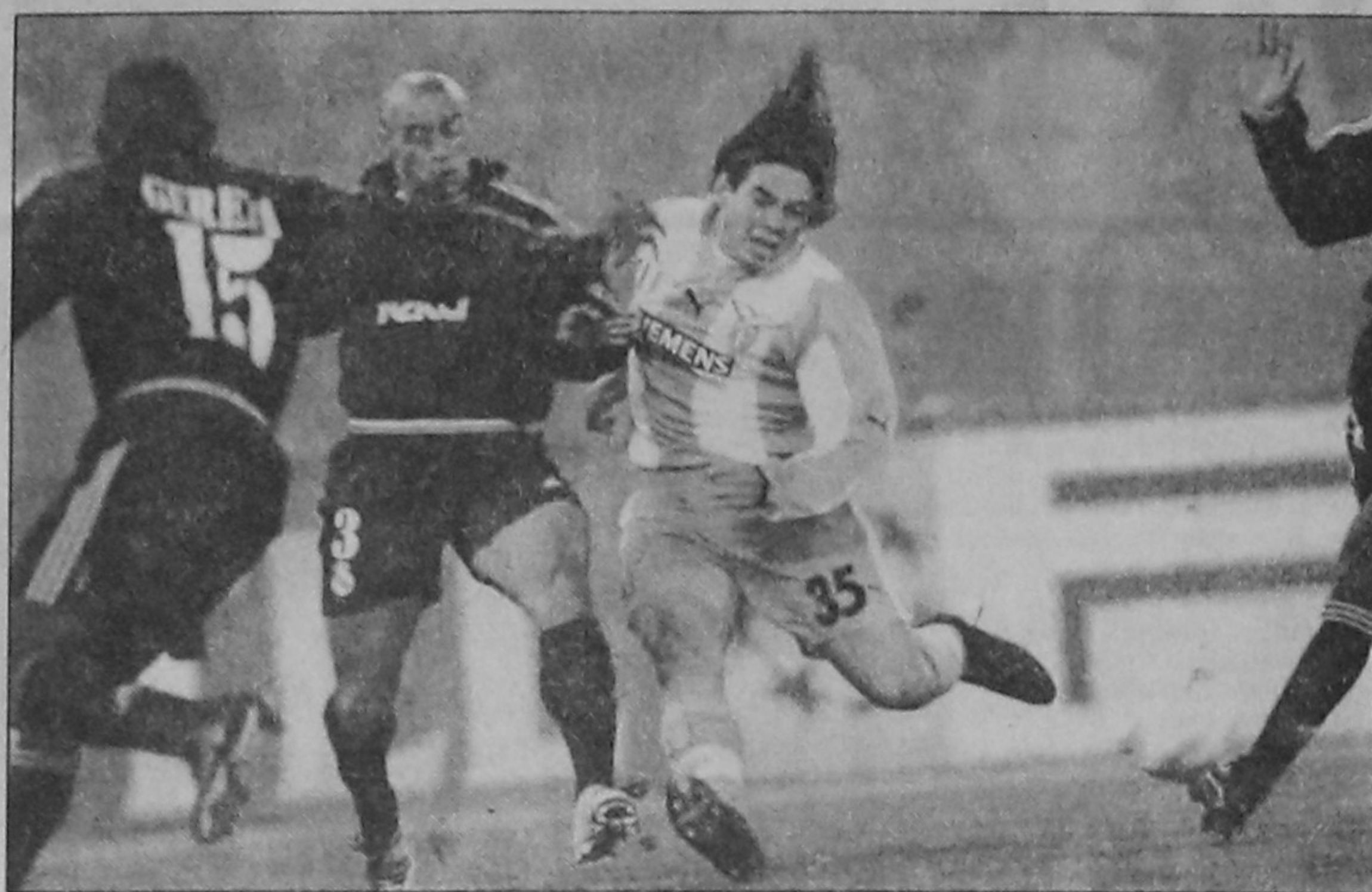
Lazio striker Lucas Martin Castroman (R) and Real Madrid defender Geremi fight for possession during their Champions' League Group D match at the Olympic Stadium in Rome on February 21.

Passarella, who won the World Cup as a player with Argentina in 1978, had been at the head of the Uruguayan team since 1999.