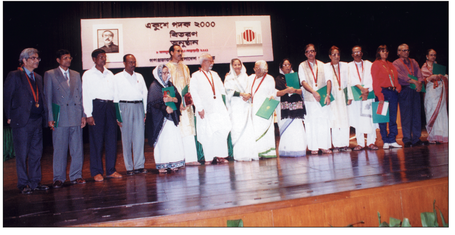
Prime Minister Sheikh Hasina among the recipients of Ekushey Padak 2000 at the Osmani Memorial Hall yesterday.