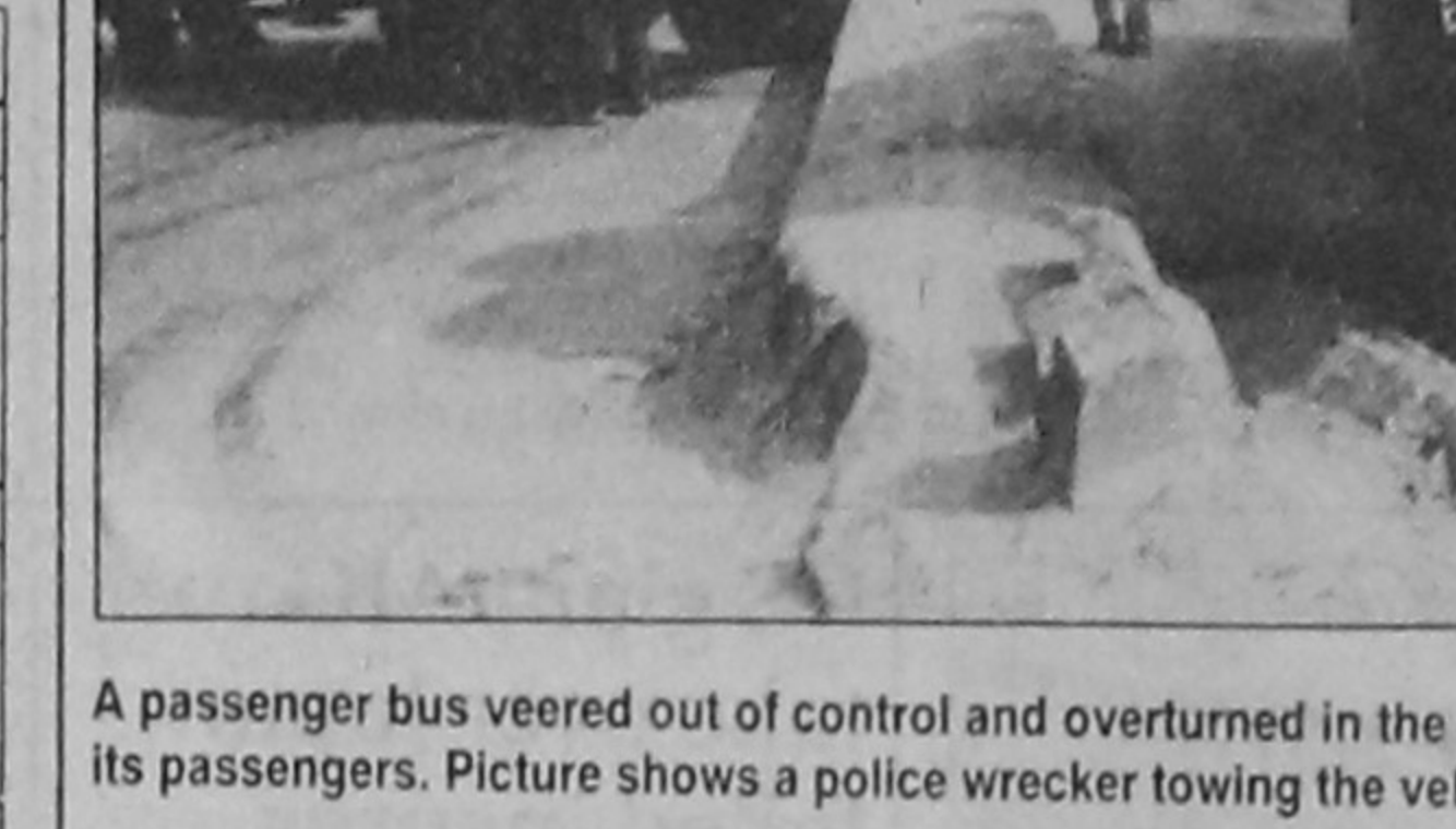
A passenger bus veered out of control and overturned in the city's Amin Bazar area yesterday, injuring some of its passengers. Picture shows a police wrecker towing the vehicle away.