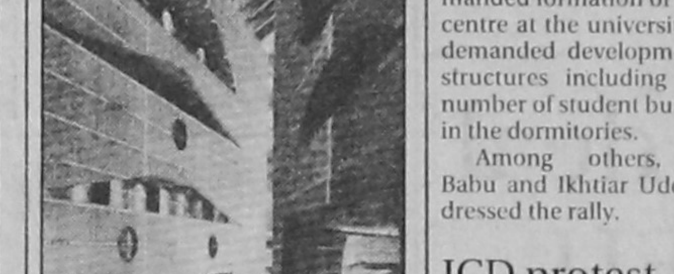
Photo exhibition at Jatiya Sangsad Bhaban today

No newspaper will be published on February 22, the release added.