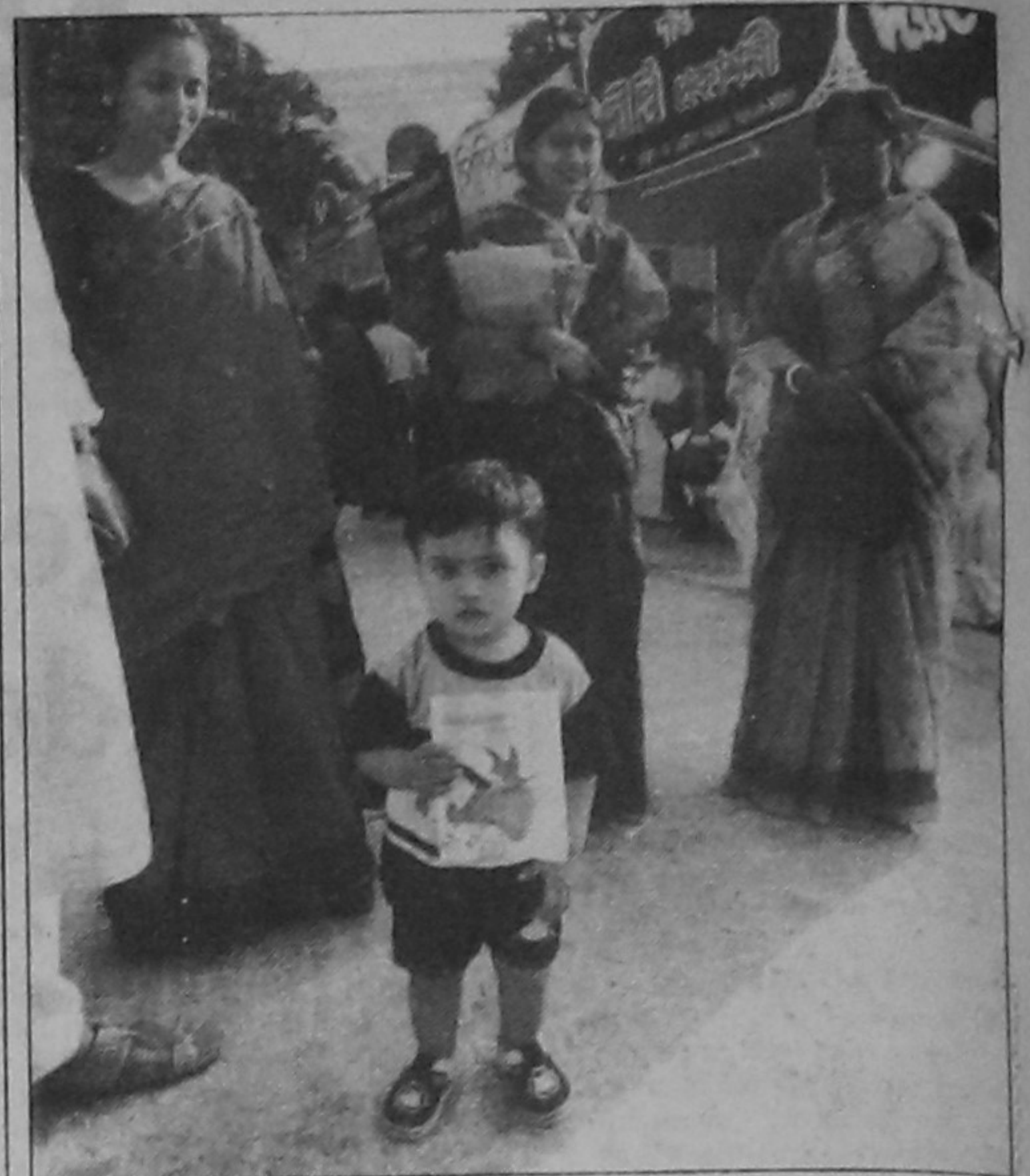
A tiny tot holds a book bought for him at the Ekushey Book Fair yesterday while his parents and family friends look on.

He said any 18-year-old citizen of the country is eligible to vote. "Irrespective of their gender, they have the right to cast vote in national and local body polls. No person or force can bar them from exercising this civic right," he added.