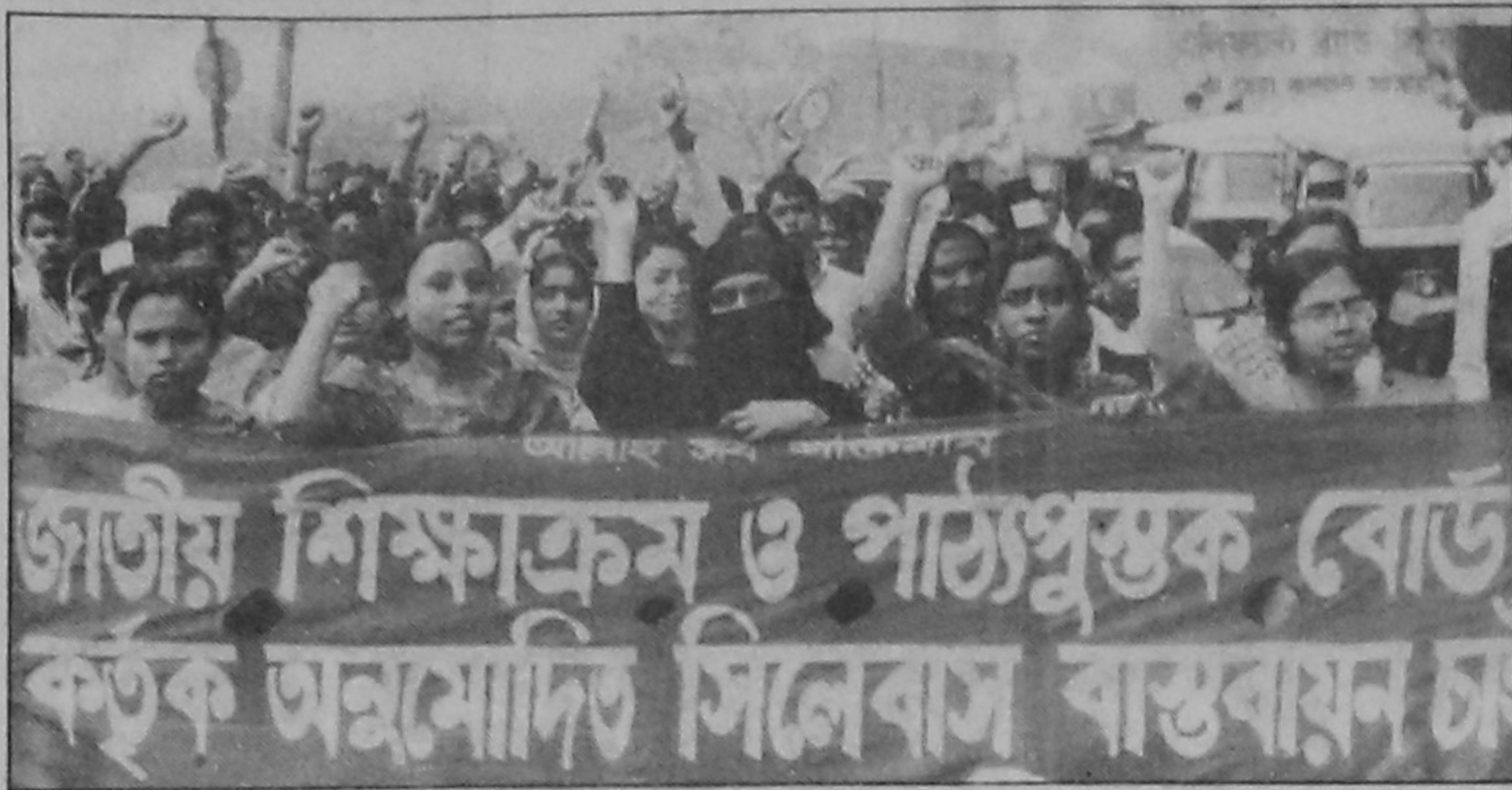
Chhatra Sangram Parishad of Institute of Health Technology (IHT) yesterday paraded the city streets demanding implementation of the National Education and Textbook Board recognised syllabus at their institute.