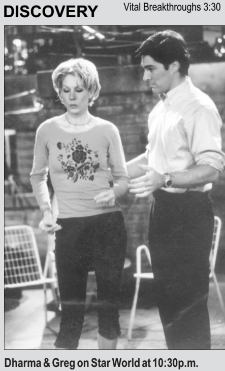
Dharma & Greg on Star World at 10:30p.m.

CHANNEL 6:30 Eyewitness II 7:00 In Care of Nature 7:30 Outer Bounds I & II 8:00 Without Warning I 8:30 Lonely Planet VI 9:30 Beyond 2000 10:00 The Quest 10:30 Go For It! 11:30 Intimate Escapes 12:30 Wild Discovery 1:30 Medical Detectives I 2:00 Medical Detectives I 2:30 Vital Breakthroughs 3:30