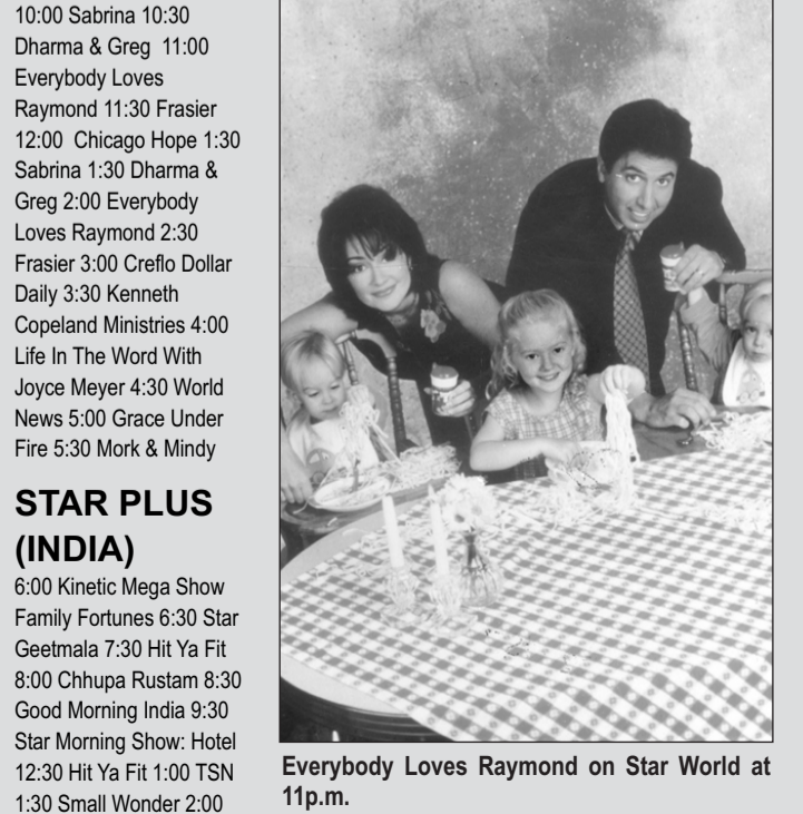
Everybody Loves Raymond on Star World at 11p.m.

8:30 Happy Days 9:00 Nash Bridges 10:00 Murder Call 11:00 The Oprah Winfrey Show 12:00 Strange Luck 1:00 Grace Under Fire 1:30 The Bold & the Beautiful 2:00 Mork & Mindy 2:30 Happy Days 3:00 Baywatch 4:00 The Simpsons 4:30 Home Improvement 5:00 STAR News Asia 5:30 Friends 6:00 Sabrina 6:30 Everybody Loves Raymond 6:45 STAR News Asia 7:00 Dharma & Greg 7:30 Frasier 8:00 Chicago Hope 9:00 Friends 9:30 STAR News 10:00 Sabrina 10:30 Dharma & Greg 11:00 Everybody Loves Raymond 11:30 Frasier 12:00 Chicago Hope 1:30 Sabrina 1:30 Dharma & Greg 2:00 Everybody Loves Raymond 2:30 Frasier 3:00 Creolo Dollar Daily 3:30 Kenneth Copeland Ministries 4:00 Life In The Word With Joyce Meyer 4:30 World News 5:00 Grace Under Fire 5:30 Mork & Mindy