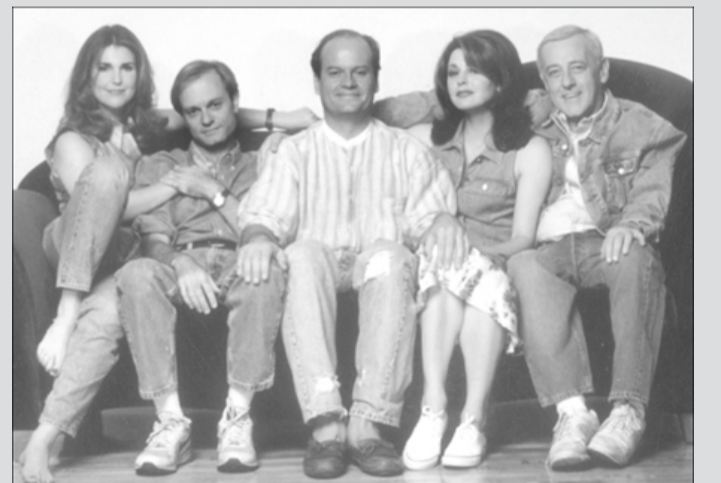
Fraiser on Star World at 11:30p.m.

Animal Survivors 4:00 In Care of Nature 4:30 Outer Bounds I & II 5:00 Without Warning I 5:30 Lonely Planet II 6:30 Crocodile Hunter's Croc Files II 7:00 Splat II & III 7:30 Wild Discovery 8:30 Wild Asia 9:30 Medical Detectives Season 4 10:00 Ultrascience II 10:30 Airborne 11:30 Discovery Profile Series 12:30 Wild Discovery 1:30 Wild Asia 2:30 Medical Detectives