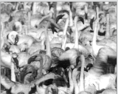
Toyota World of Wild Life on Ekushey television at 7p.m.