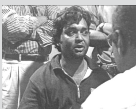
The 1st episode of the new drama series Lohar Churi on Ekushey television at 3:05p.m.

BTV 3:00 Opening Announcement 3:20 Open University 4:00 Khabar 4:05 Educational Programme 4:30 Shasthathatha: Healthcare programme for mother and children 4:45 Sports Programme 5:20 Anu Poromanu: Science programme for teenagers 5:45 Puschitathaya 6:00 Khabar 6:10 Unmesh 6:35 Lok Lokalo: Programme by tribal 7:00 News Headlines 7:05 Dolon