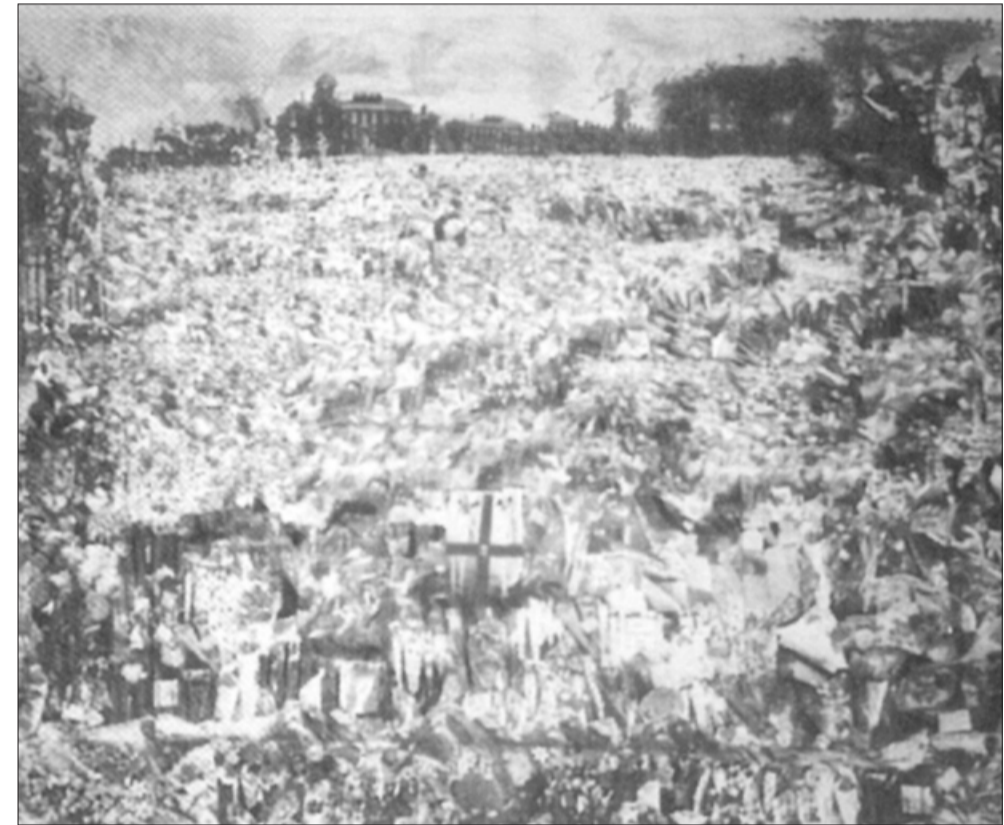
Royal Art, Diana's Flowers.