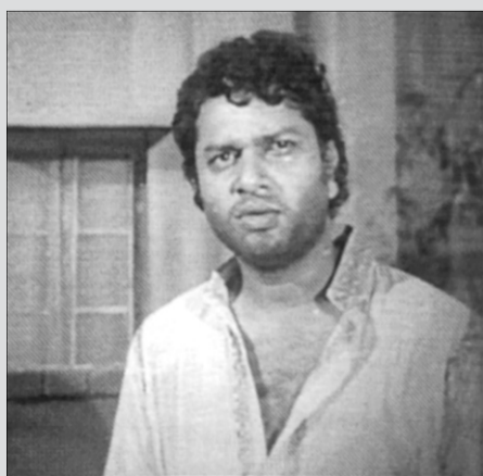
Bengali movie Notun Prithibi on Ekushey television at 8p.m.