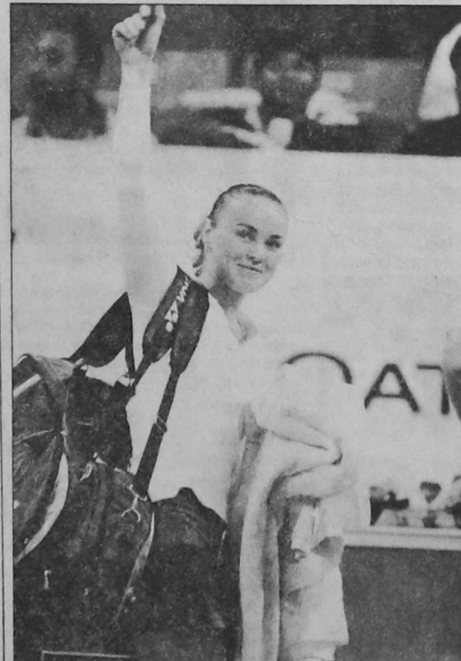
World 1 No Martina Hingis of Switzerland waves to the crowd after defeating Austrian Barbara Schett in the Qatar Open semifinal in Doha on February 17.