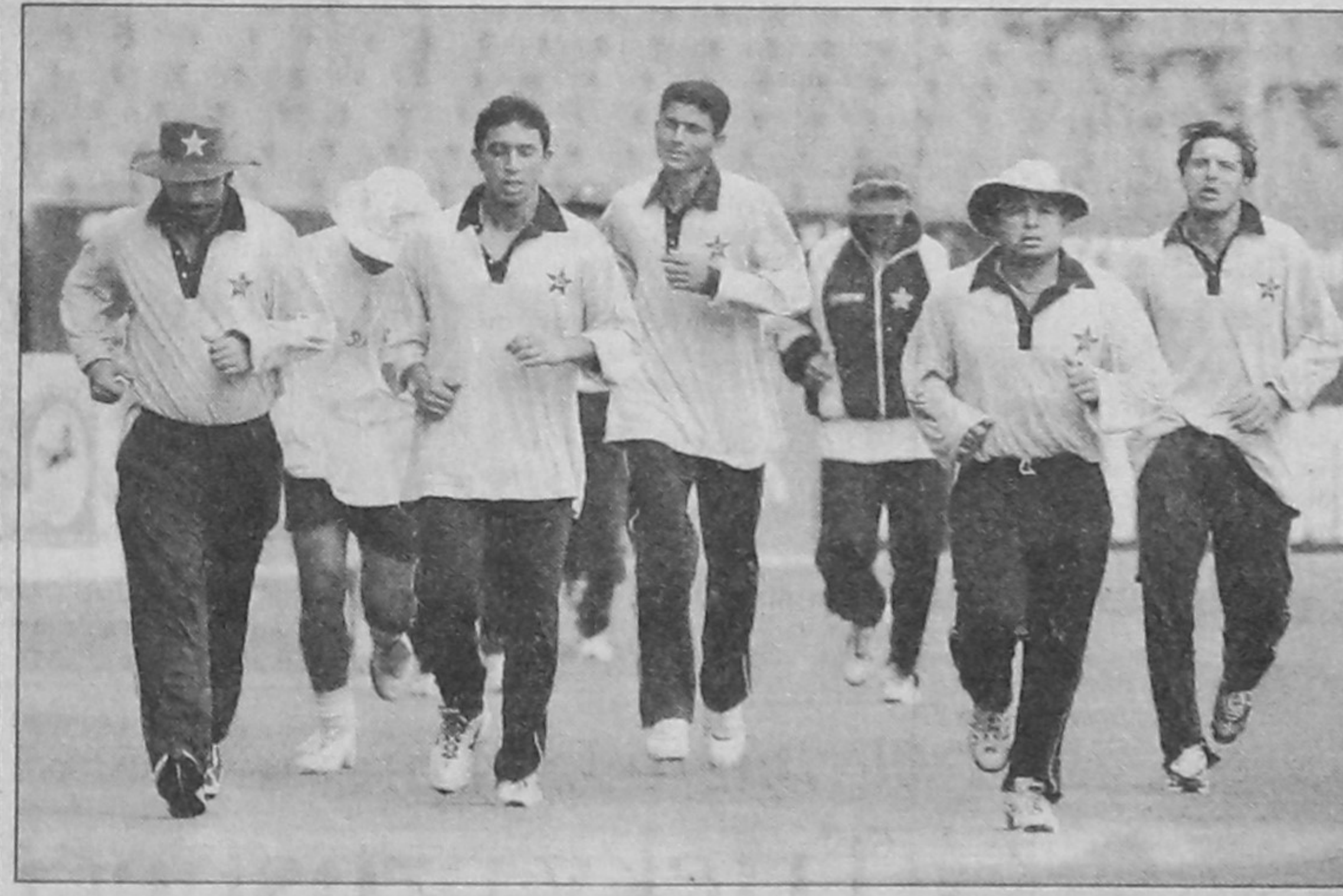
Pakistan cricketers jogging at the Eden Park yesterday. They take on New Zealand in the first of five one-day internationals here today.