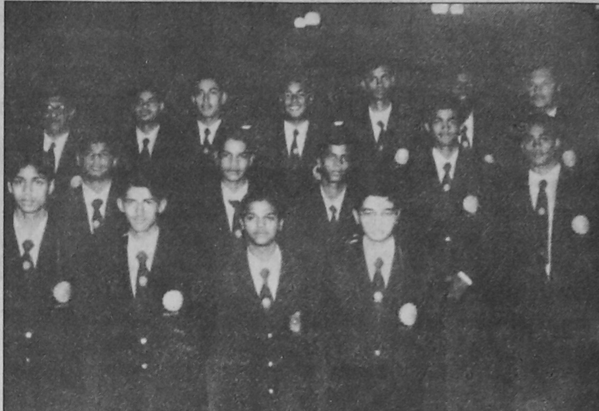
The Indian team that came to Dhaka yesterday to take part in the GrameenPhone Second Under-17 Asia Cup cricket tournament.