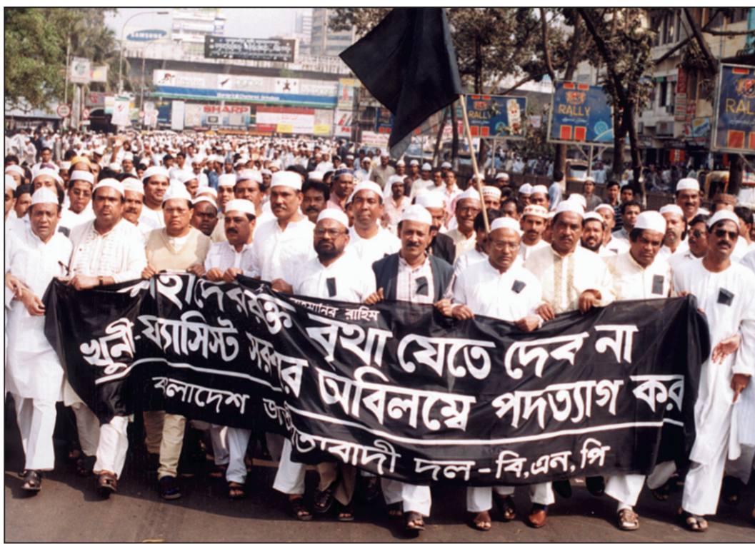
The four-party alliance brought out a procession in the city yesterday to mourn the killing of four in firing at Malibagh Crossing during hartal hours on Tuesday.