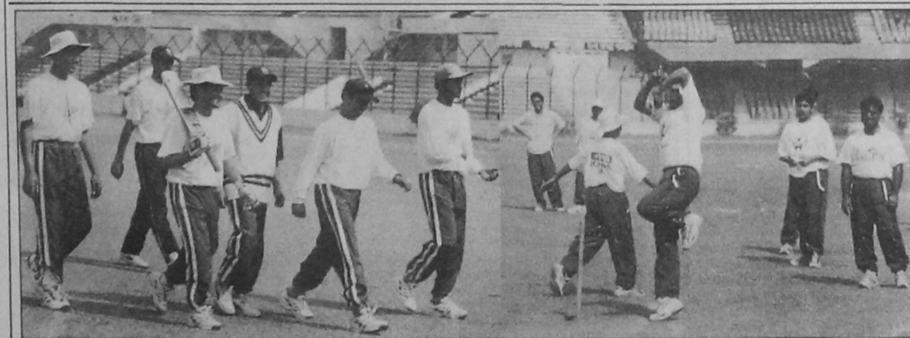
Pakistan under-17 cricket team members (L) taking to the field for a practice session while a Kuwaiti youngster (R) honing his bowling skills as his teammates look on at the Bangabandhu National Stadium yesterday.