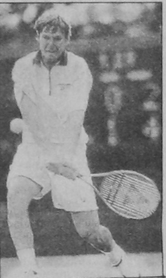
Yevgeny Kafelnikov (Russian tennis star) "I will do my best to win the Davis Cup this season. This is the only trophy I have failed to win during my career and I will probably quit in the event of our winning this season."