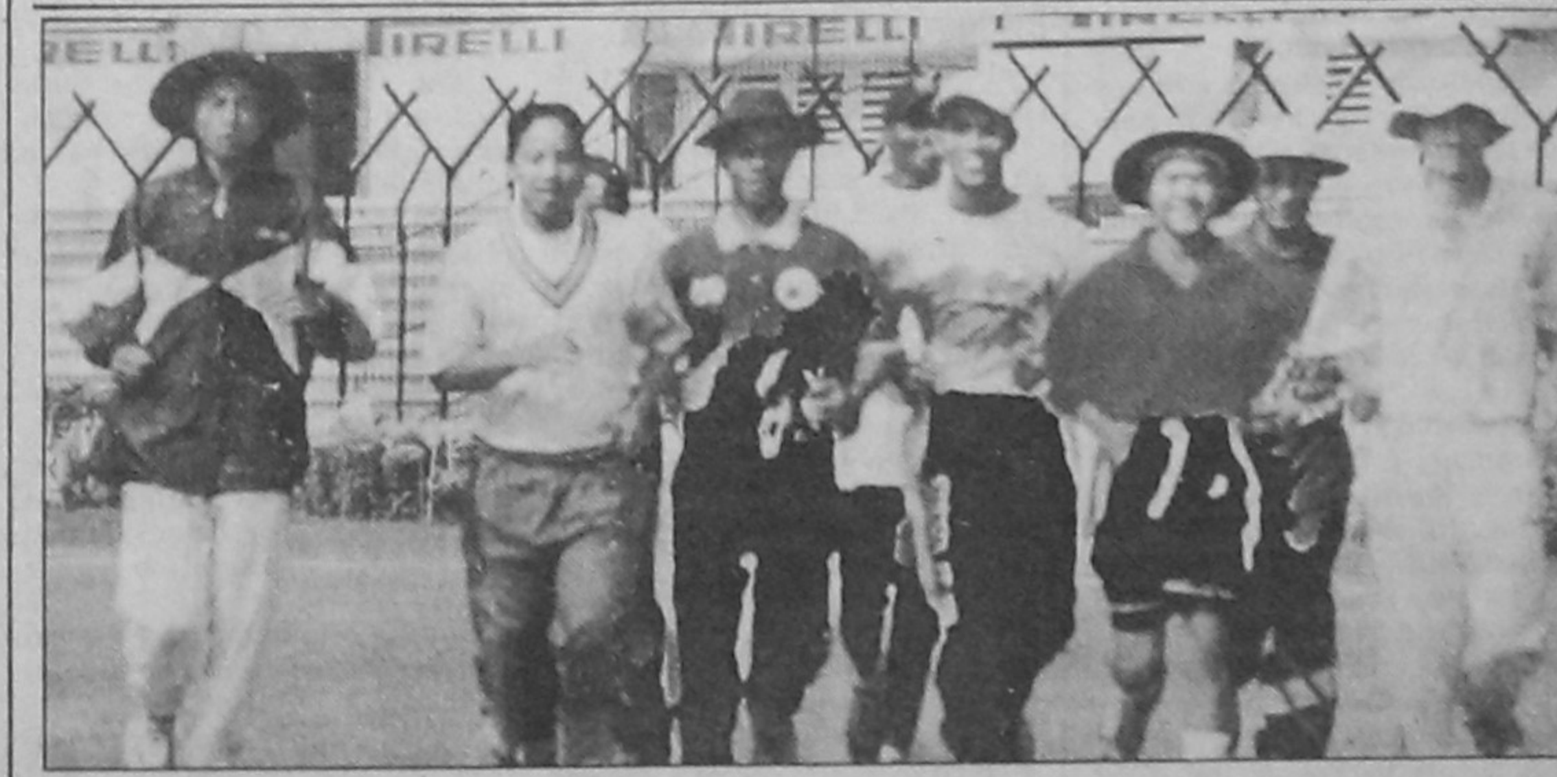
Malaysia cricketers jogging at the Bangabandhu National Stadium yesterday.