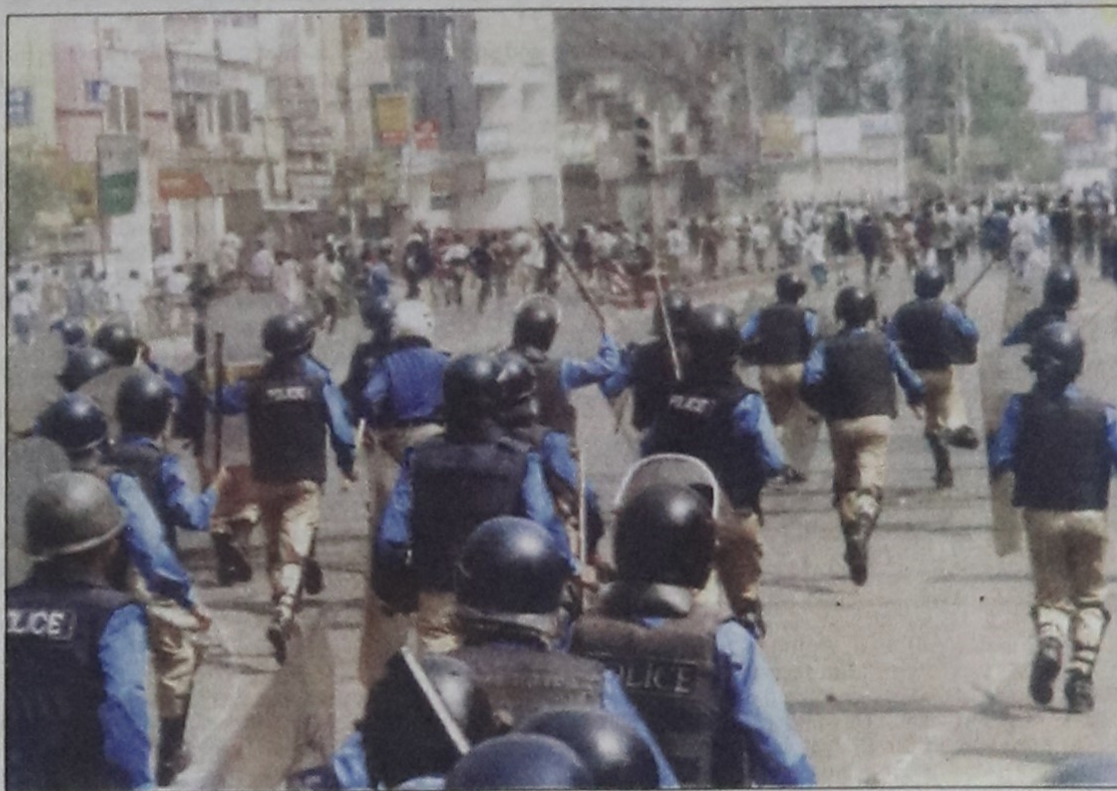
Police in riot gear chasing pro-hartal activists in city's Bijoy Nagar area yesterday during the hartal hours.

They discussed various issues of business interests.