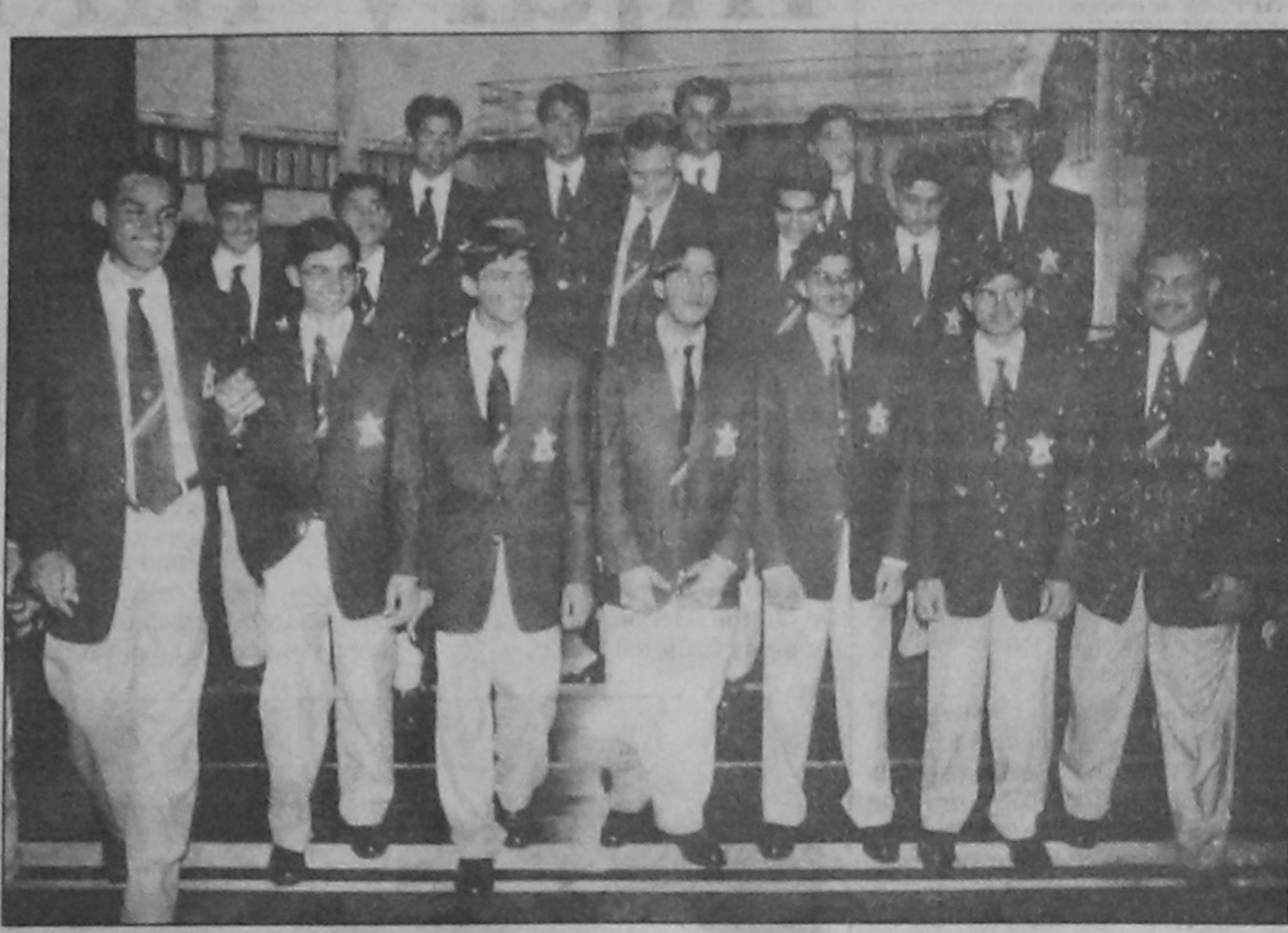
The Pakistan team that came here yesterday to take part in the GrameenPhone Second Under-17 Asia Cup cricket tournament.