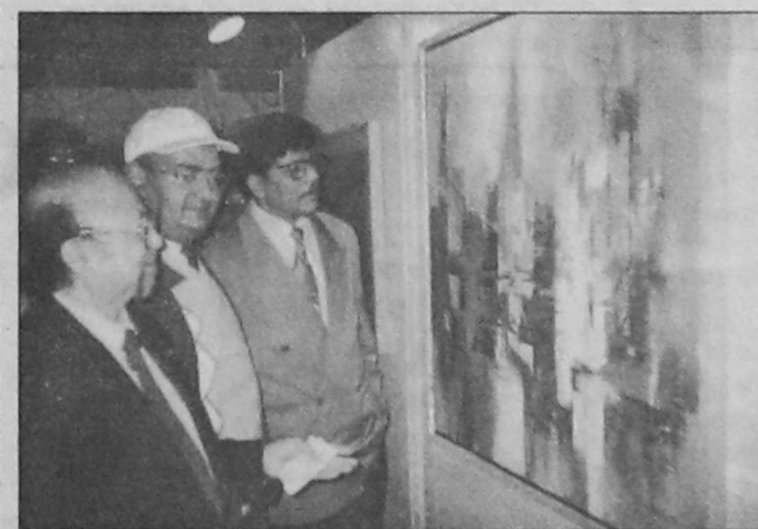
A 6-day long 'mobile art exhibition' is underway in Thakurgaon as part of Bangladesh Shilpakala Academy's countrywide mobile art exhibition. Eminent artist Prof Hashem Khan formally inaugurated the exhibition on February 9.