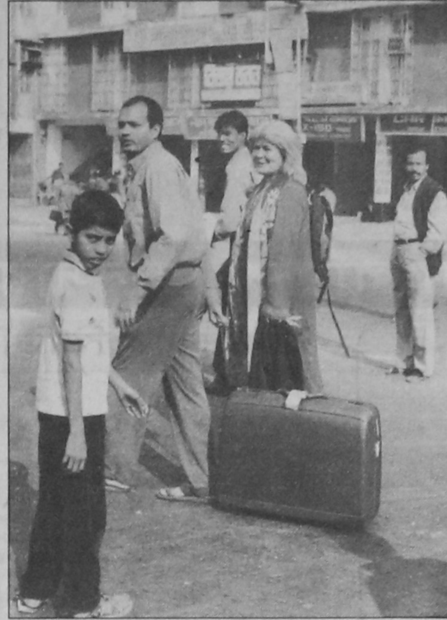
A female foreigner is in a desperate search for a mode of transport to get her to the Zia International Airport during hartal hours yesterday.

Plans for Russo-German cooperation in spheres such as the energy industry, agriculture and investments, were also on the table.