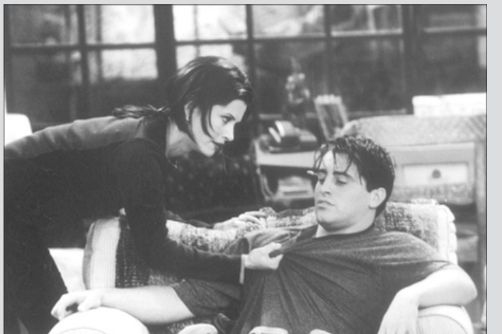
Friends on Star World at 9 tonight

7:30 Outer Bounds I & II 8:00 Without Warning I 8:30 Lonely Planet VI 9:30 Beyond 2000 10:00 The Quest 10:30 Go For It! 11:30 Intimate Escapes 12:30 Wild Discovery 1:30