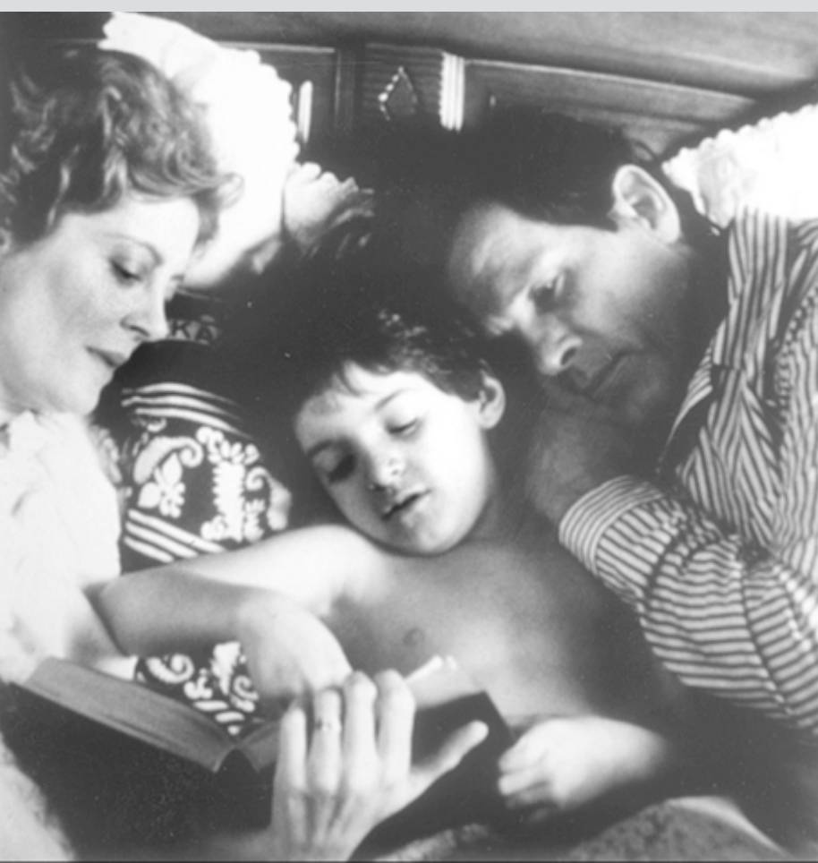
Lorenzo's Oil on HBO at 10 tonight. Based on a true story, this remarkable and heartwarming tale chronicles Nick Nolte and Susan Sarandon as two parents who battle time and the medicine establishment to save their son's life who is suffering from a rare disease.

4:00 CNN This Morning 4:30 Asia Business Morning 5:00 CNN This Morning 5:30 Asia Business Morning 6:00 CNN This Morning 6:15 Asia Business