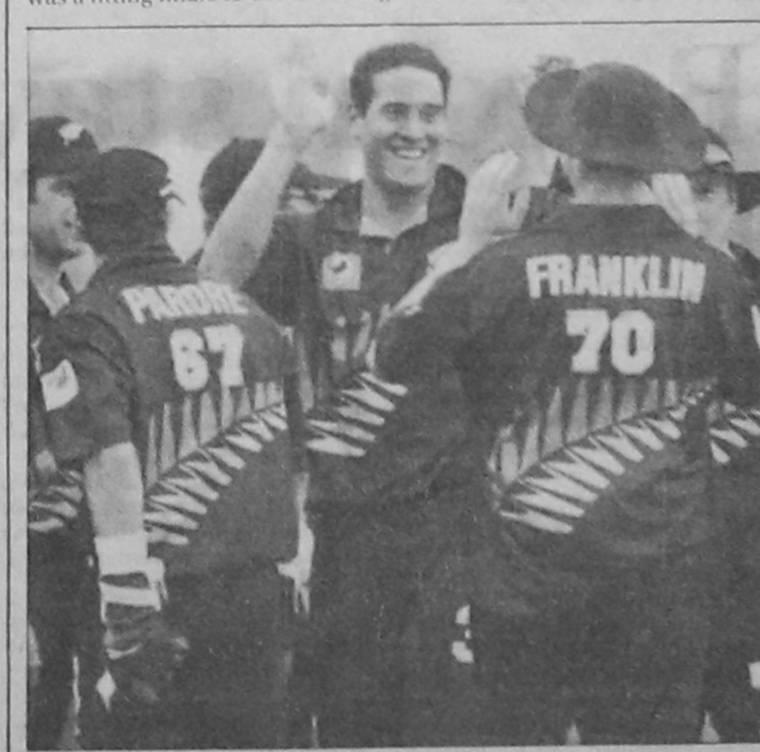
New Zealand players celebrate the fall of a Sri Lanka wicket during the fifth and final one-day international in Christchurch yesterday.

series, with New Zealand scoring 292 and Sri Lanka falling short on 269. Sri Lanka had to score 14 off the last over with just one wicket remaining and Muttiah Muralitharan hobbling and using Russel Arnold as a runner. The tourists were rocked by a fine opening spell from James Franklin and Daryl Tuffey and within seven overs had lost three wickets, with the dangerous Sanath Jayasuriya and Aravinda de Silva victims of left-armers Franklin and Kumar Sangakkara falling lbw to Tuffey. But a 99-run partnership between Marvan Atapattu and Mahela Jayawardene put Sri Lanka back on the path and after those two went Kumar Dharmasena and Russel Arnold took over with a 59-run stand. Nuwan Zoysa provided the final push with some big hitting, but he fell to a catch on the long-on boundary in the penultimate over. New Zealand's heroes were Jacob Oram, Man of the Match, with his big-hitting 59, Chris Harris (52no) and Lou Vincent's (31no) sixth wicket partnership of 85 in 63 balls to push the home side to easily their biggest score of the series and set Sri Lanka a much sterner task than they had managed to date.