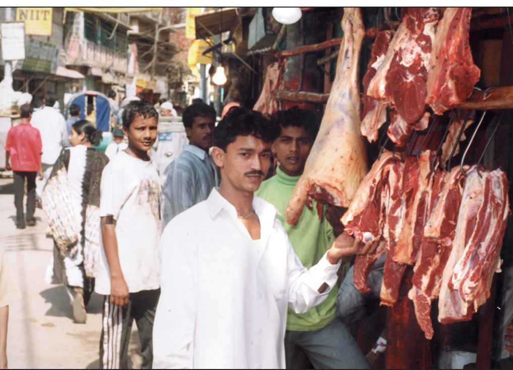
In absence of effective monitoring, illegal street-side meat shops are mushrooming in the city.

'After slaughter, the vet's responsibility is to check different organs of the animal. If it is found that the heart or liver or any other organ is infected, the meat is not fit for human consumption," he said.