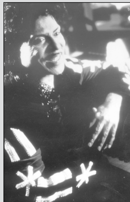
Dancing in the Street on BBC World at 6:10 in the evening

MOVIES 9:30 Our Dancing Daughters 11:10 Three Little Words 2:20 Her Cardboard Lover 3:30