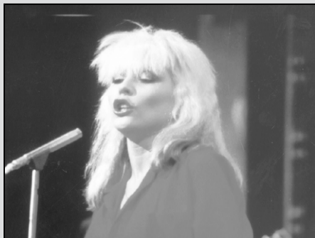
Rock Family Trees on BBC World at 9:10 tonight

EKUSHEY TV 2:00 Ekushey Headlines 2:05 Aker Potrikay 2:15 Ei Shoptaho 2:40 Classic Cartoons 3:00 Ekushey