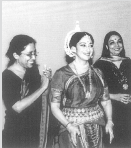
Bengal Shilpalaya in i Focus on Channel i

6:30 Animal Survivors 7:00 I Care of Nature 7:30 Outer Bounds I&II 8:00 Without Warning I 8:30 Lonely Planet VI 9:30 Cafe Digital 10:00 Medical Detectives 10:30 Extreme Machines 11:30 Amazing Worlds 12:30 Wild Asia 1:30 Ultimate Guide 2:30 Trauma IV- Life in the ER 3:30 Uncharted Africa 4:00 I Care of Nature 4:30 Decisive Weapons (I&II) 5:00 Discovery News 5:30 Assignment Discovery 6:30 Real Kids, Real Adventures 7:00 Splat IV 7:30 Medical Mysteries 8:30 Health Showcase 9:30 New Detectives III 10:30 Journeys to the Ends of the Earth 11:30 Trailblazers II 12:30 Medical Mysteries 1:30 Health Showcase 2:30 New Detectives III 3:30 Journeys to the Ends of the Earth 4:30 Trailblazers II 5:30 Lifeline