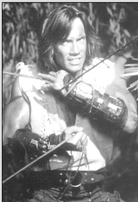
Hercules on Star World at 4 this evening

6:00 BBC News 6:30 World Business Report 7:00 BBC News 7:30 Asia Today/World Business Report 8:00 BBC News 8:30 Asia Today/World Business Report 9:00 BBC News 9:30 Asia Today/World Business Report 10:00 BBC News 10:30 Hardtalk 11:00 BBC News 11:30 Talking Movies 12:00 BBC News 12:30 Question Time India 1:30 Click Online 2:00 BBC News 2:30 Dancing in the Street 3:00 BBC News 3:30 Rock Family Trees 4:00 BBC News 4:30 Holiday 5:00 BBC News 5:30 This Week 6:00 BBC News 6:30 Dancing in the Street 7:00 BBC News 7:30 I Caesar