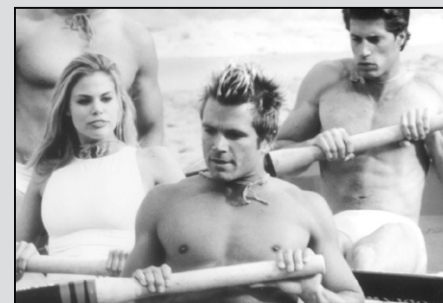
Bay Watch on Star World at 10 tonight

6:00 The Adventures of Sinbad 7:00 The Simpsons 7:30 Things People Do 8:00 The Bold & The Beautiful 10:00 TV Com. 10:30 Travel Asia 11:00 Fox Kids Goosebumps 1:00 World Championship Wrestling Niro 3:00 Baywatch 4:00 Hercules 5:00 Xena 6:00