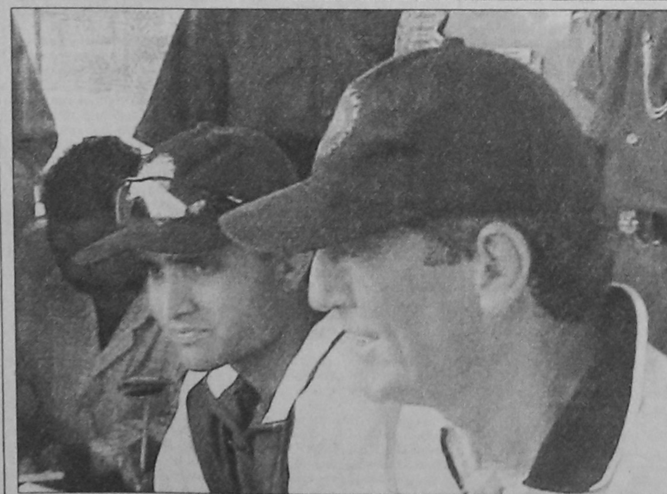
India cricket team captain Saurav Ganguly (L) and coach John Wright address a media conference in Madras on February 8. A conditioning camp is currently in progress in that Indian city to select the national team to face Australia.

Letters were sent to the 11 players telling them they had been