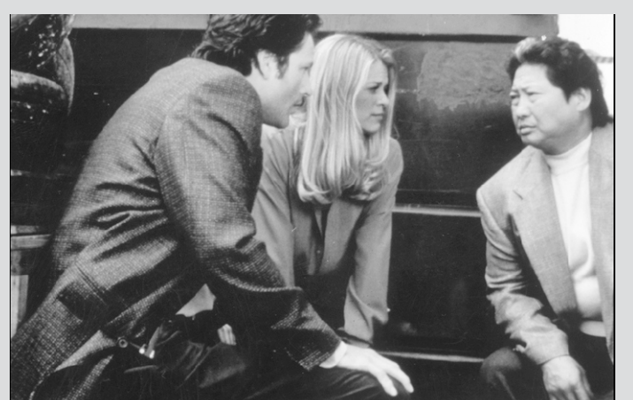
Martial Law on Star World at 8:00 p.m.

CA USA 4:30 Argentine Football Copa Cordoba Cordoba, Argentina Boca Juniors 6:30 School Quiz Show ESPN School Quiz Olympiad 7:30 New Zealand Cricket Sri Lanka, Tour Of New Wellington, New Zealand Sri Lanka Highlights 8:30 Sportscenter Hindi 9:00 Premier Snooker League 2001 11:00 School Quiz Show ESPN School Quiz Olympiad 11:30 Sportscenter Hindi 12:00 College Gymnastics Sec Gymnastics-Super 6 Kickoff Tuscaloosa, AL 11:00 Motoworld 11:30 Winter X-games Winter X-Games Day 1:00 Sportscenter Bristol 2:00 Snooker Billiards Espn World Snooker: 2001 Nations Cup reading, England Semifinal 4:00 Extreme Programming 2001 Paul Mitchell X Qualifier Squaw Valley,