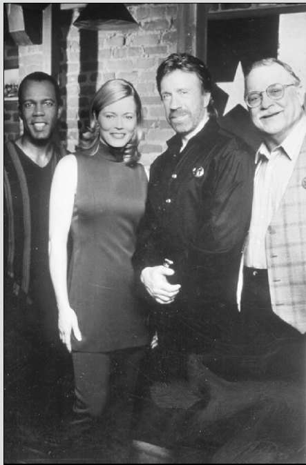
Walker Texas Ranger on Star World at 7:00 p.m.

Jharokha 8:30 Good Morning India 9:30 Star Morning Show: Shoorveer 12:30 Hit Ya Fit 1:00 TSN 1:30 Small Wonder 2:00 Meri Saheli 2:30 Saans 3:00 Shagun 3:30 Kabhi Kabhie Mere Ghar Mein Bhuchaal Aata Hai 4:00 Kyunki Saas Bhi Kabhi Bahu Thi 4:30 Cine Jharokha 5:00 Hit Ya Fit 5:30 Kuchha Papad Pucca Papad 6:00 Small Wonder 6:30 Fox Kids 7:30 Kahaani Ghar Ghar Ki 8:00 Tu Tu Main Main 8:30 Ma Shakti 9:30 Kaun Banega Crorepati 10:30 Kahaani Ghar Ghar Ki 11:00 Kyunki Saas Bhi