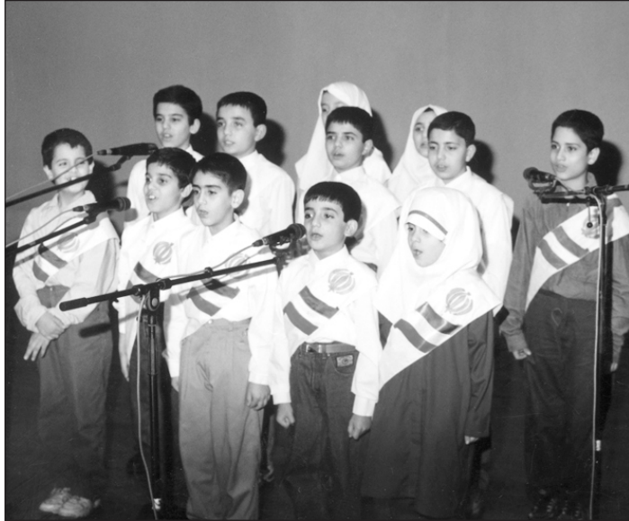
Iranian children singing national anthem at the inaugural ceremony.