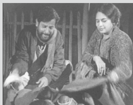
Asaduzzaman Noor and Sara Zaker in tele-film Jotsnar Phool on Channel I at 11:00 tonight.

12:00 Ekushey News Headlines 12:05 Aiker Potrikay 12:15 Bangla Movie: Obohela 2:40 Drishti 3:00 Ekushey News Headlines 3:05 Drama Series: Shodh