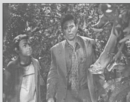
English serial Amazon on Ekushey TV at 8:00 p.m.

BTV 3:20 Open University 4:00 Khabar 4:05 Cartoon film: Burney and Friends 4:20 Ta Ta Thai Thai : Dance Lessons for Children 5:00 TV School Debate 5:45 Dharma-O-Jiban 6:00 Khabar 6:10 Programme