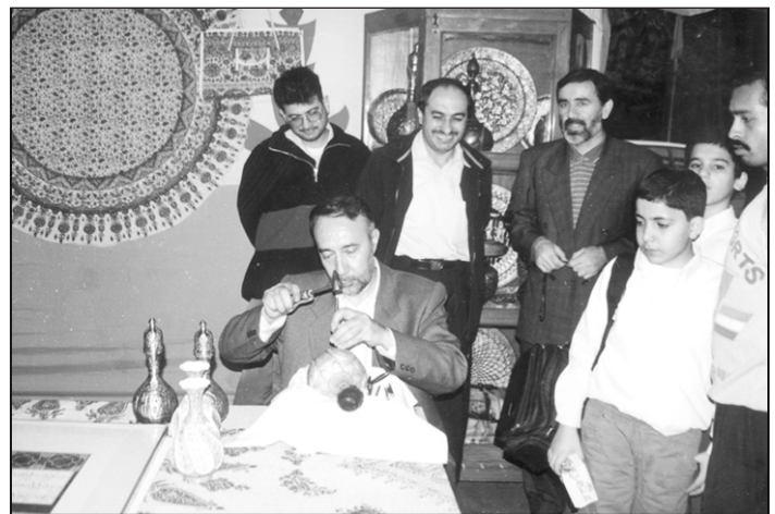
Curious visitors look on while an engraver is engaged in his work on a metal pot at the exhibition. This intricate engraving requires an artist's patient devotion.