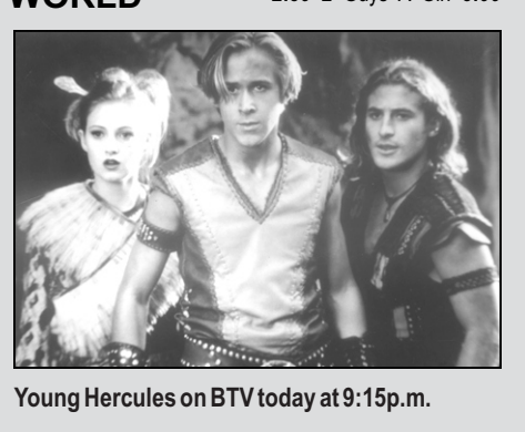
Young Hercules on BTV today at 9:15p.m.