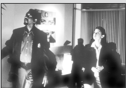
Kiss The Girls on HBO at 10 tonight

Watch out for this terrific suspense thriller. A serial killer is on the loose. His modus operandi is to kidnap girls and kill them at his leisure. Alex Cross, a forensic detective and best-selling crime author gets into the act when his niece becomes the latest victim. So who is the killer? Watch out.