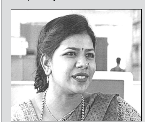
6th episode of the drama serial Bismriti will be aired on Ekushey television tonight at 8