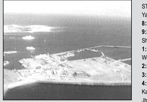
Charidike, topic: Dipabali on Ekushey television today at 6:30 in the evening

12:00 Ekushey News Headlines 12:05 Ajker Potrikay 12:15 Bangla Movie: Alo Amar Alo 2:40 Driшти 3:00 Ekushey News Headlines 3:05 Drama Series: Choto Choto Dheu 3:30 Bhalobasha Kare Koy 4:00 Bauliana 4:30 Expedition to the Animal Kingdom 5:00 Circus 5:50 Ajker Potrikay 6:00 Ekushey News Headlines 6:05 Classic Cartoons 6:30 Charidike 7:00 Bolte Chai 7:30 Ekushey News 8:00 Drama Serial: Bismriti 8:45 Nila Namer Mayati 10:00 BTV News 10:25 Amazon