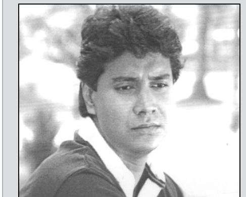
Drama Nila Namer Meyeti on Ekushey television tonight at 8:45

BTV 3:20 Open University 4:00 Khabar 4:05 Programme on Mother and Child Health Care 4:20 Cartoon film: