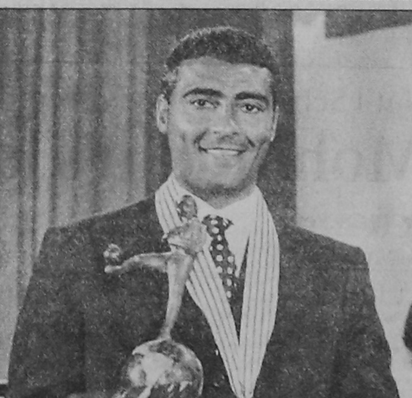
Brazil and Vasco da Gama superstriker Romario with the Best soccer player in America, 2000 trophy in Montevideo on February 4. Uruguayan newspaper El Pais awarded him the trophy after conducting an opinion poll among more than 300 journalists from nearly 60 countries in America and Europe.

"But it is important to win the friendly against Spain and then our two games against Finland and Albania."