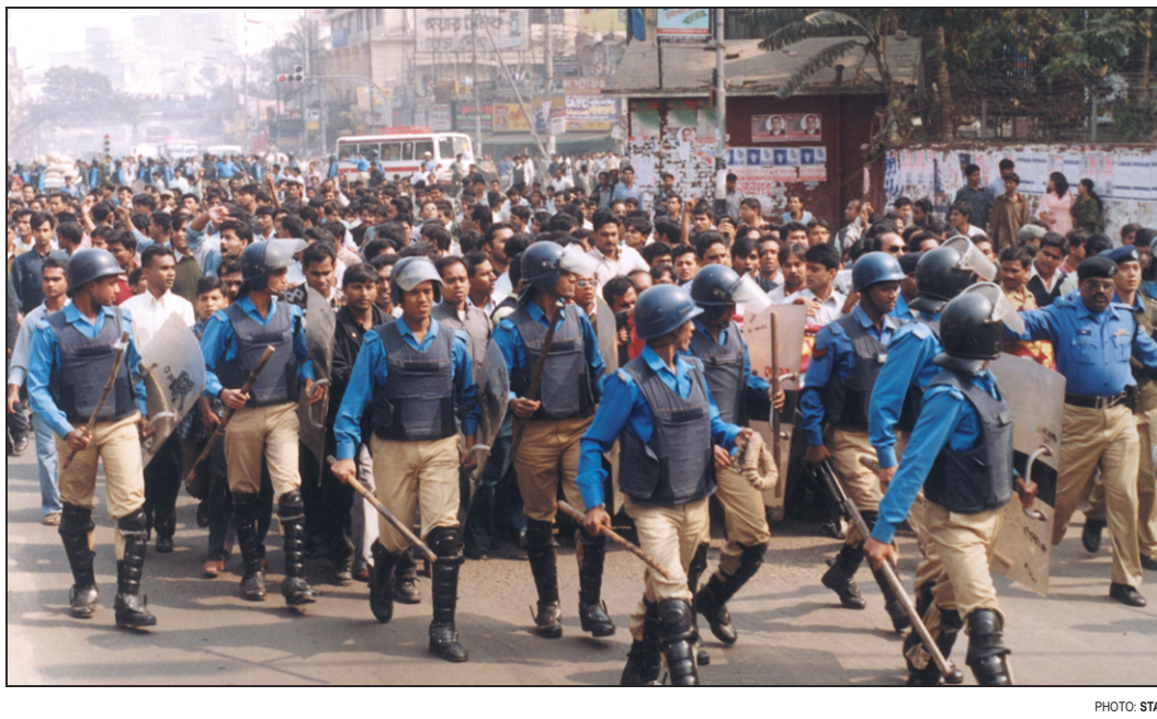
Police guarding a JCD procession towards Shikkha Bhaban in the city yesterday. The procession was brought out from Muktangan demanding immedi