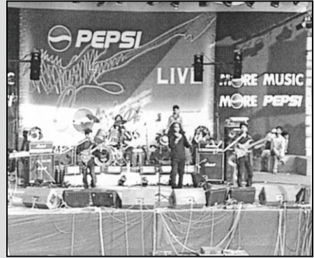
Pepsi Concert-4th part on Ekushey TV at 8:00 pm.

6:15 I Close Up 6:50 Akattorer Dinguli 7:00 Sports Time 7:40 Sai Sur Sai Gane 8:00 Din Protidin 8:25 Job Line 9:00 Amar Chobi 9:50 I Focus 10:00 Reciting from Holy Quran 10:10 Deser