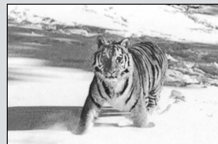
Toyota World of Wild Life on Ekushey TV at 7:00 pm.

session of the Parliament Expedition to the Animal Kingdom 5:00 Circus 3:20 Open University 4:00 Khabar 4:05 Educational programme 4:30 Programme on mother