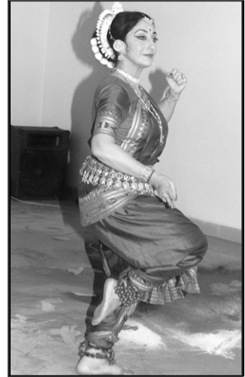
Dhanmondi road no 27 recently.

The performance, aptly titled Footprints on Canvas, was held at the Bengal Shilpalaya premises at