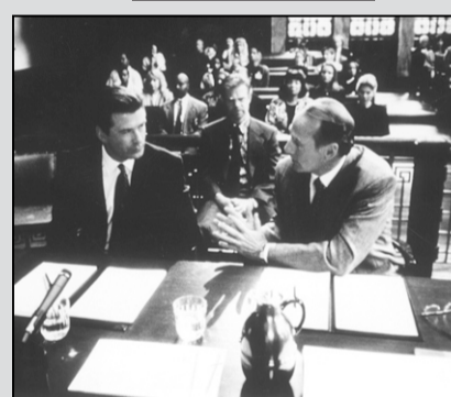
Ghosts of Mississippi on HBO at 10 pm. Alec Baldwin stars as a dedicated young trial lawyer and Whoopi Goldberg as the victimised widow of the renowned civil rights leader Medgar Evers in this gripping true murder story.