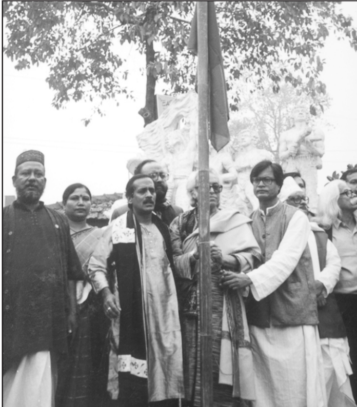
Shamsur Rahman, best known poet of the country, declares the poetry festival open by raising the national flag.

Overall, it was a great occasion for the poets and the poetry loving people of the country to savour multilayered, multi-falvoured poetry written in Bangla language.