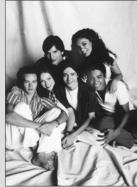
That '70s Show on Star World at 6:00pm

Premier Football League (R) 6:30 Australia Cricket Carlton Series 2001 Perth, Australia Zimbabwe @ Australia 12th Odi, Highlights (R) 7:30 Italian Football Hillies Italian Serie A 2000/2001 Highlights (T) 8:30 Sportscenter Hindi (L) 9:00 Premier Snooker League Premier Snooker League 2001 (T) 11:00 Extreme Programming 2001 Paul Mitchell X qualifier Squaw Valley, CA USA (T) 11:30 Sportscenter Hindi (T) 12:00 XBS (T) 12:30 Argentine Football Copa Ciudad De Mar De Plata Mar Del Plata, Argentina Boca Juniors @ River Plate (T) 2:30 Sport News Sportscenter Hindi (R) 3:00 Billiards Snooker Billiards Espn World Snooker: 2001 Nations Cup Reading, England Round Robin (T) 5:00 Sportscenter Bristol, CT USA (L) 6:00 Motoworld (T) 6:30 Sportscenter Hindi (R) 7:00 Snowmobiling 00/01