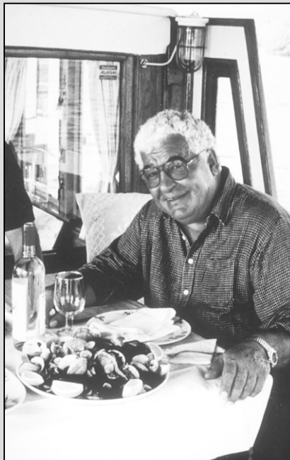
Antonio Carluccio's Italian Feast on BBC World at 11:30 am and 7:30 pm.

4:00 CNN This Morning 4:30 Asia Business Morning 5:00 CNN This Morning 5:30 Asia Business Report/Asia Today