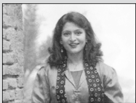
Sargam on channel i at 8:00 pm.

8:30 Beete Hue Din 9:00 An Evening in Paris (Shammi Kapoor, Sharmila Tagore) 12:00 Geet Bahar 12:30 Sawan Ki Ghata (Manoj Kumar, Sharmila Tagore) 3:30 Geet Bahar 4:00 Bewafai