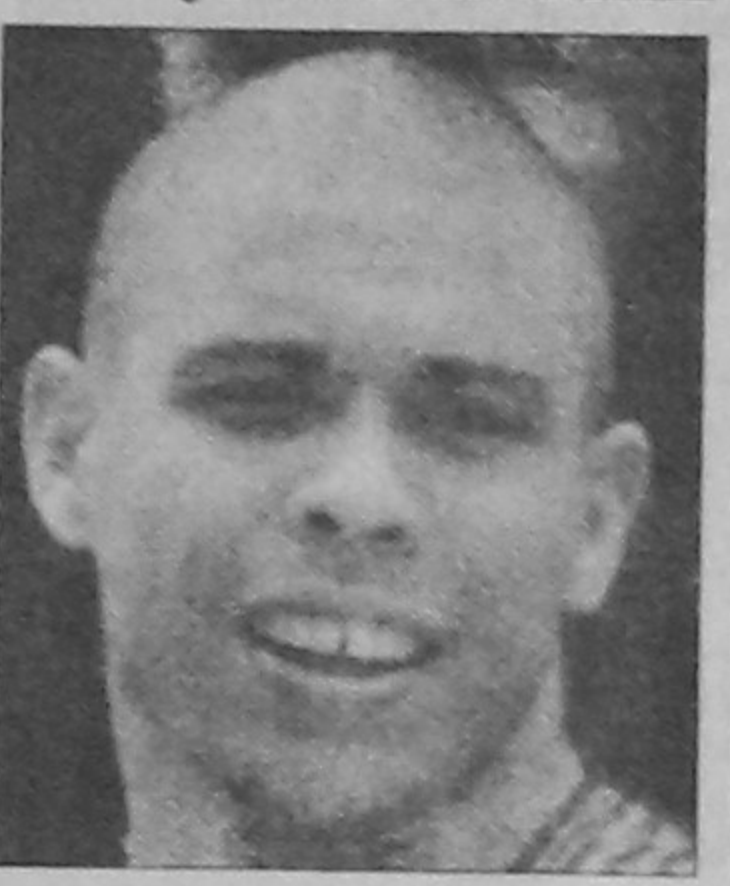
Ronaldo (Brazilian football star) "All I am now thinking of is that I will return to top form and that I will be the same as I once was."