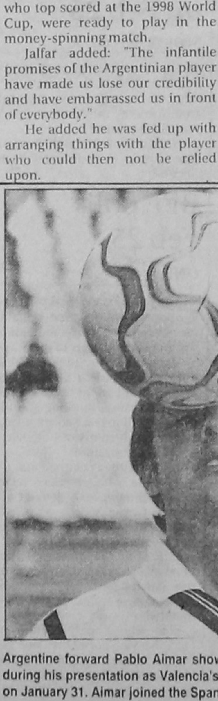
Argentine forward Pablo Aimar shows his mastery over the soccer ball during his presentation as Valencia's new recruit at the Mestalla Stadium on January 31. Aimar joined the Spanish club from River Plate.