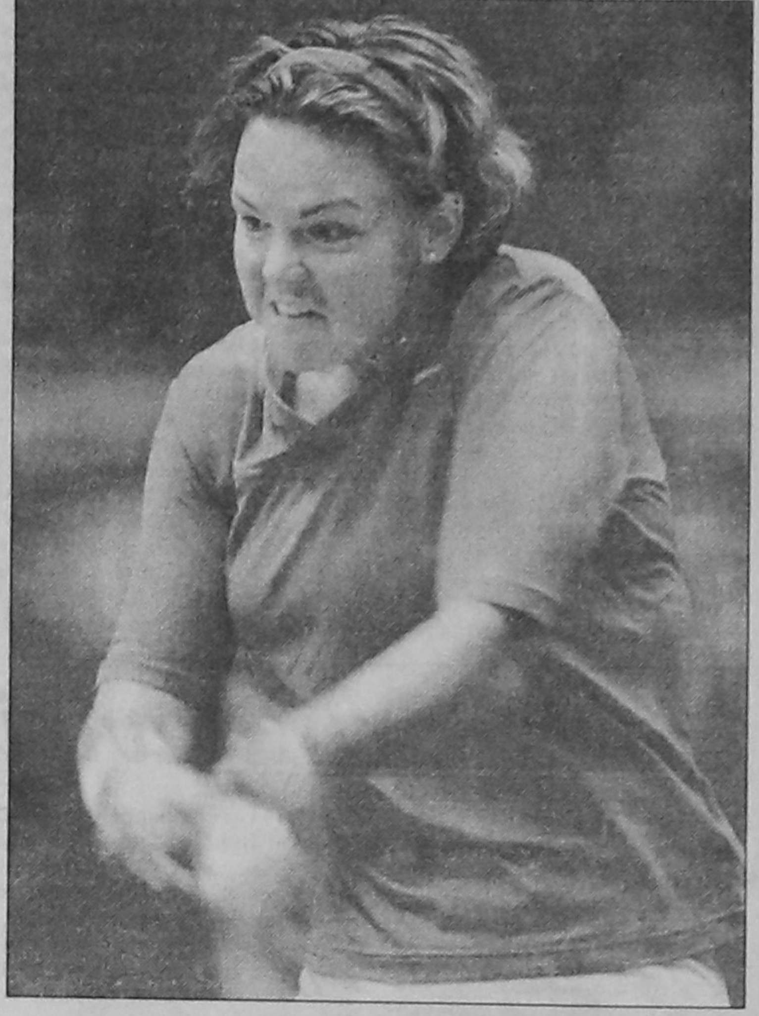
American Lindsay Davenport in action against compatriot Meghann Shaughnessy during their Pan Pacific Open second round engagement yesterday.

"She is a consistent baseliner, she returns very well, so I have to be ready for some serves to come back and just try and outthrust her from the baseline," she added.