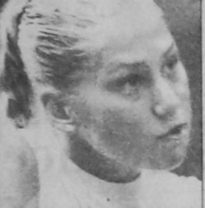
Anna Kournikova (Russian tennis star)

"I think all of you people, or most of the people forget that I'm 19 years old. And you could see, you know, that Jennifer Capriati, she won her first Grand Slam title when she is 24, so I think that I have another five years to work on it." After she, who has never won a WTA title, was criticised for putting her image before her tennis.