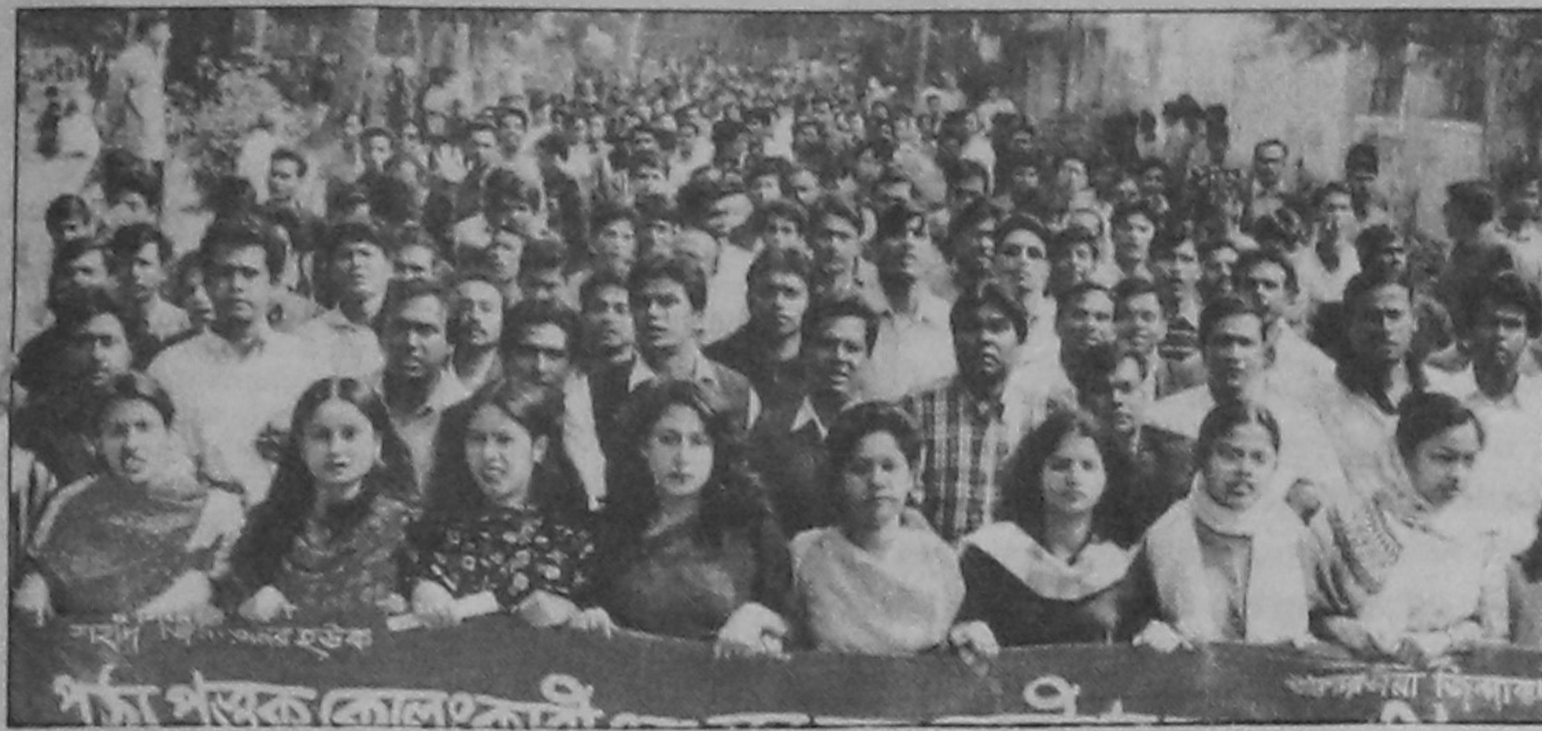
Jatiyatabadi Chhatra Dal paraded the DU campus yesterday protesting the board textbook scam and terrorist activities of BCL at the university dormitories.