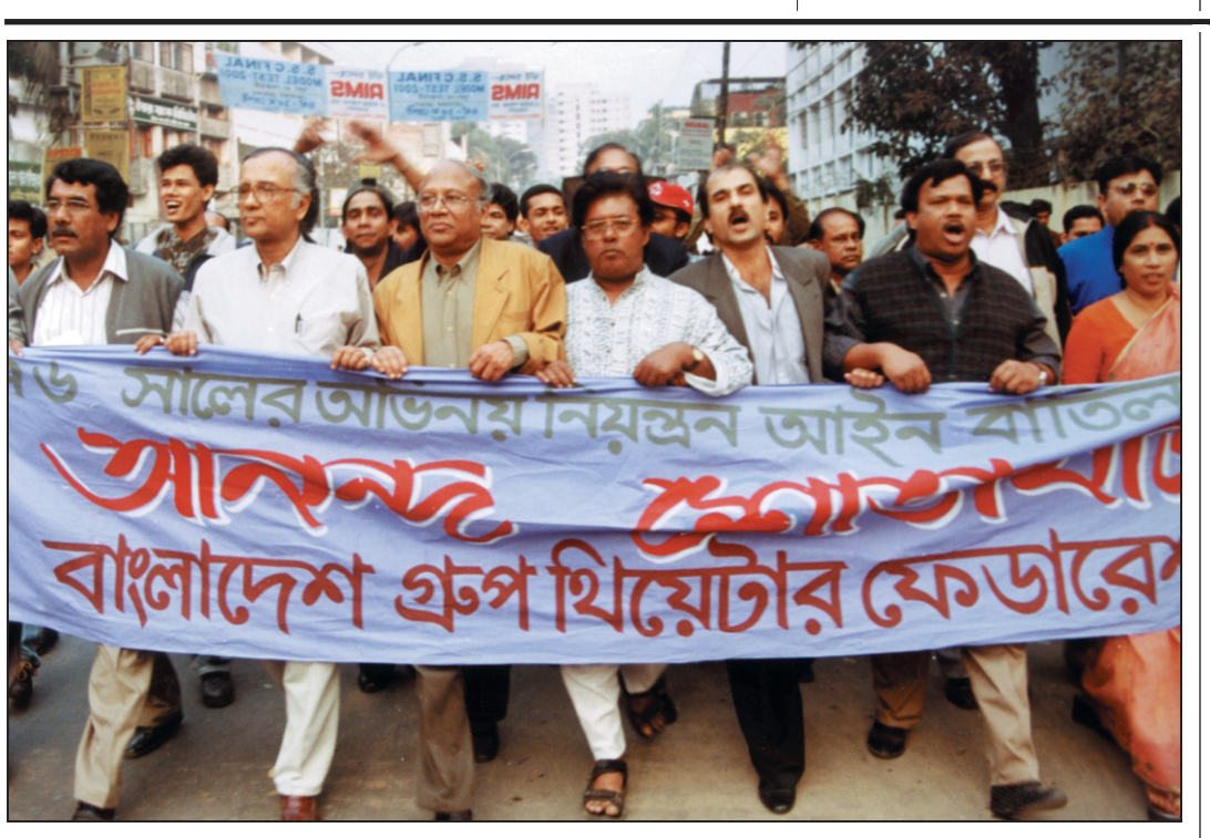
The Bangladesh Group Theatre Federation brought out a procession in the city yesterday, welcoming repeal of the

Some NBR sources said a section of foreign ministry officials might be involved in the corrupt practices regarding diplomats' cars