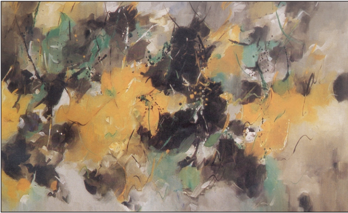
Joy of Victory

ety of subjects as topics. Animate and inanimate objects alike as the river, hills, boats, trees, people have found a place on her canvas with ease and grace. These pictures have sometimes been depicted in strong hues of blues, yellows and red/browns. At other times the same have taken shape in the use of softer hues that make them come alive in a different manner. In Fountain of Light for example the strong hues of yellow and reddish brown make the story come true in its expression of the theme. In Spring melody likewise, the combination of colours creates a harmony that is the very essence of a spring brightness. In her other paintings as Blue Rhythm and Joy of Victory! Song of the Night, the use of blue is more prominent. Blue, usually a colour of pain, is used in different expressions in Asma's paintings and in some places creates a beauty quite unique of it's own. In Song of the Night for example the serenity of the beauty of a night is capture din the use of the hue of blue alone. Asma began her stint with art at an art school in New York headed by Peter Baboux and later continued her training with the renowned Corcoran School of art in Washington DC in 1970. She has had a large number of exhibitions abroad including in Pakistan, Australia, Thailand, USA and Switzerland. She has also held had shows in Dhaka at different times. The exhibition at National Museum will remain open till February 12.