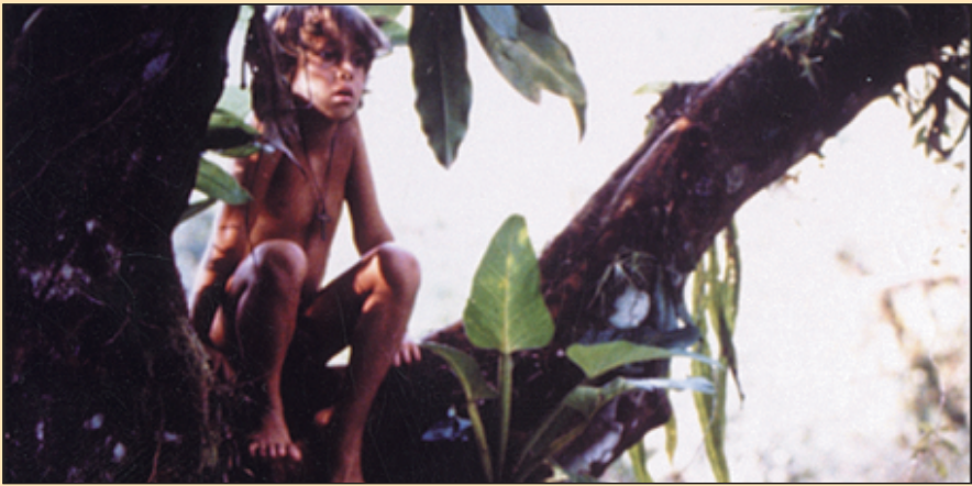
Where The River Runs Black (Alessandro Rabelo, Charles Durning) at 9:30 p.m On Z MGM

Morning 6:15 Face to Face 6:50 Akattorer Dinguli 7:00 Drama : Taka 7:40 Spy cam. 8:00 Din Protidin 8:25 Business File 9:00 Sawpno Dhekhe Mon 10:00 Reciting from Holy Quran 10:10 Aker Vitore Pauch. 10:40 Addar Table 10:55 Drama : Dahone Darod 11:15 Face to Face 11:50 Akattorer Dinguli 12:00 Drama : Taka 12:40 Spy cam. 1:15 Business File. 2:00 Sawpno Dhekhe Mon 2:50 I Focus 3:00 Bangla Cinema : Sikol Evening 6:00 Reciting from Holy Quran 6:10 Special Programme 6:40 Addar Table 7:15 Khathai Khathai 7:50 Akattorer Dinguli 8:00 A Special Programme on Jahir Raihan 9:15 Jiboner Gane 10:00 Anuvobo Anukhane 10:50 I Focus 10:00 Bangla Cinema : Beder Meyya