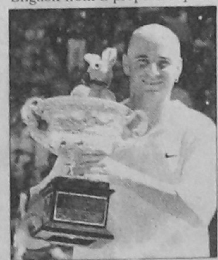
Agassi with winner's trophy