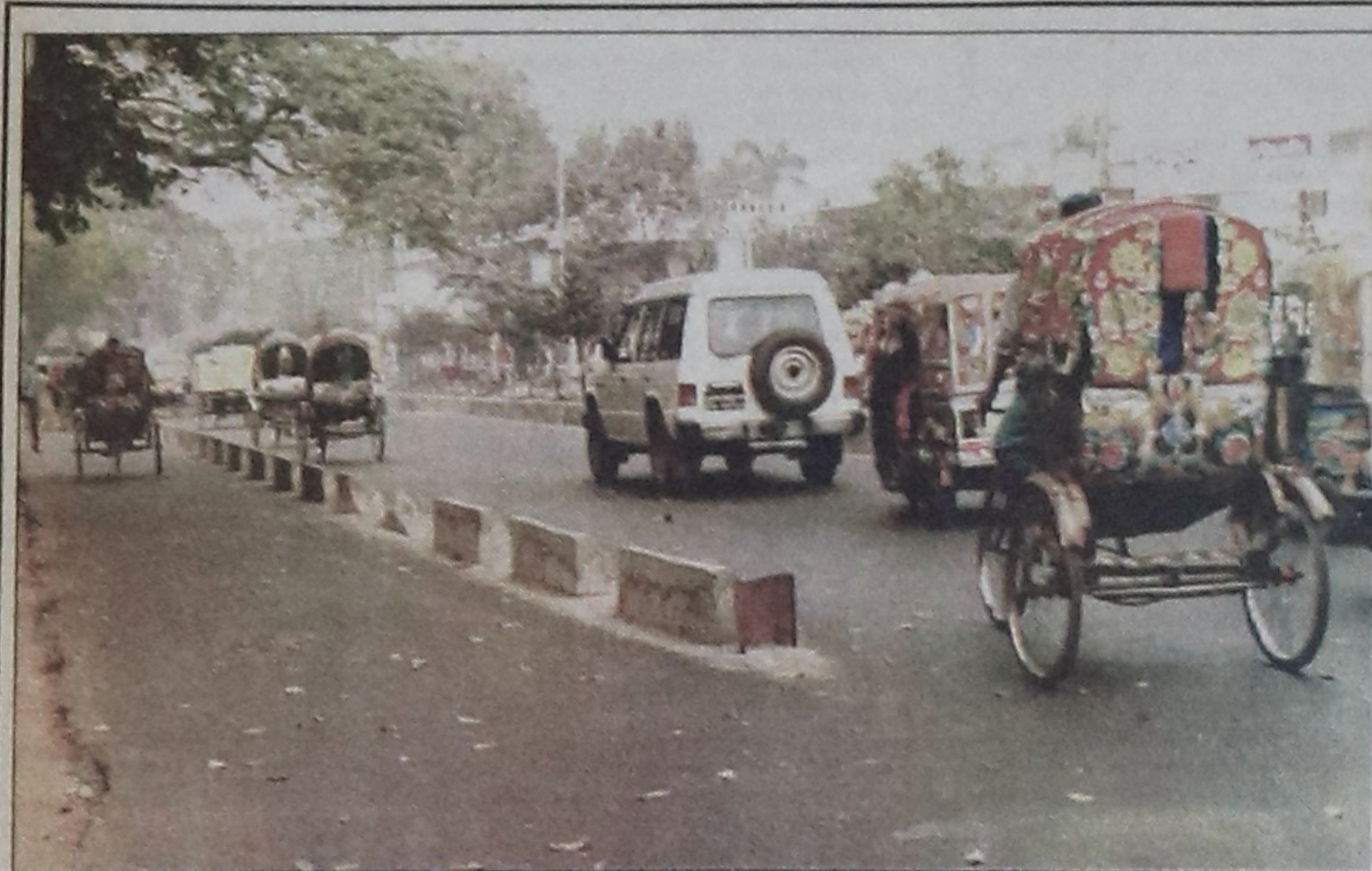
Lame lane separators... rickshaws and rickshaw-vans join the stream of motorised vehicles, ignoring lanes, separated by concrete blocks, for the non-mechanised vehicles. The DCC project has complicated the traffic movement, instead of easing the congestion, complain many.

All Philips Products are Available on Instalments and are backed by Countrywide Warranty.