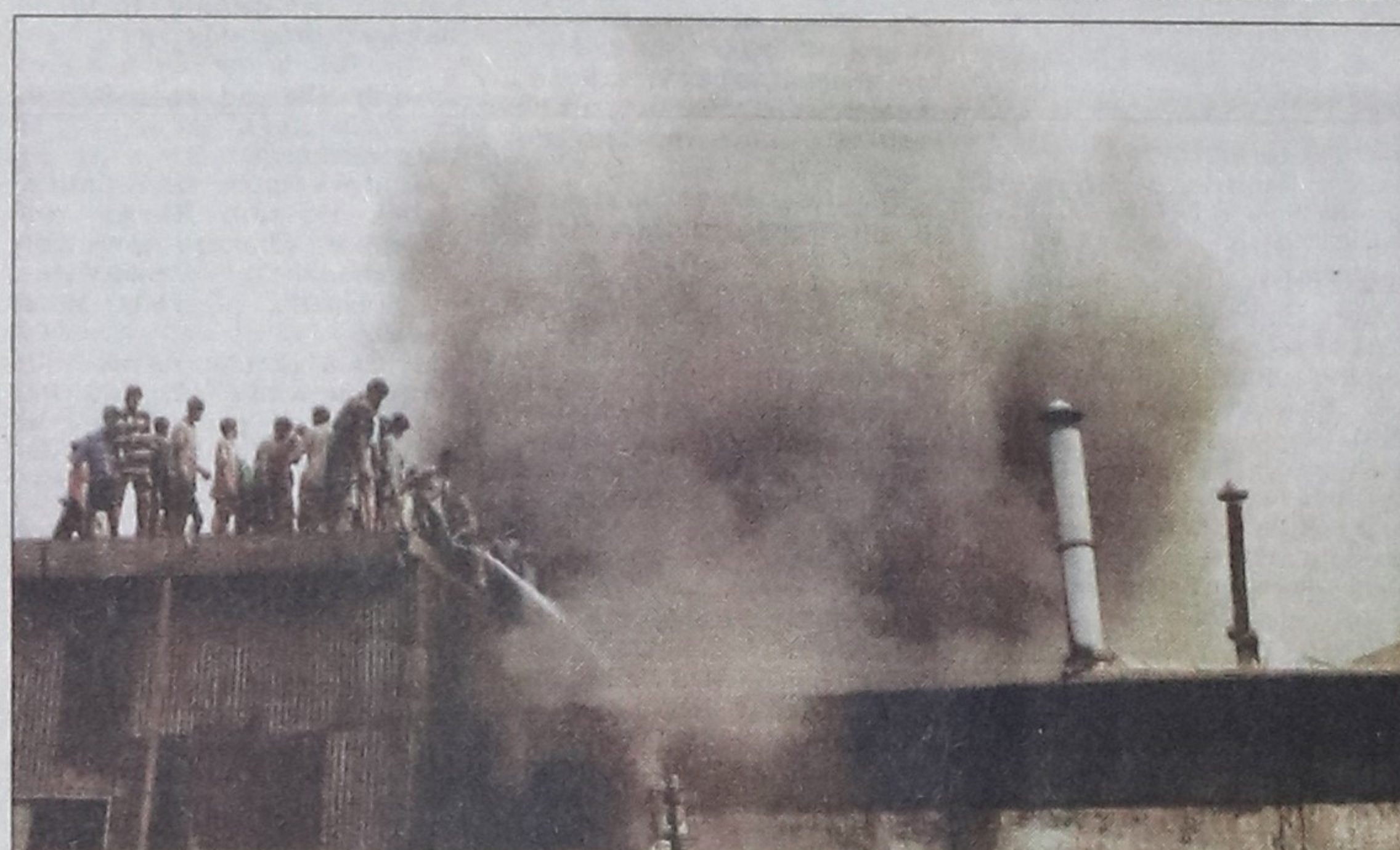
Local people help fire-fighters douse the fire at a bitumen factory in the city's Nakhla para area yesterday. Fear of fire triggered a stampede in a nearby garments factory, killing one worker.