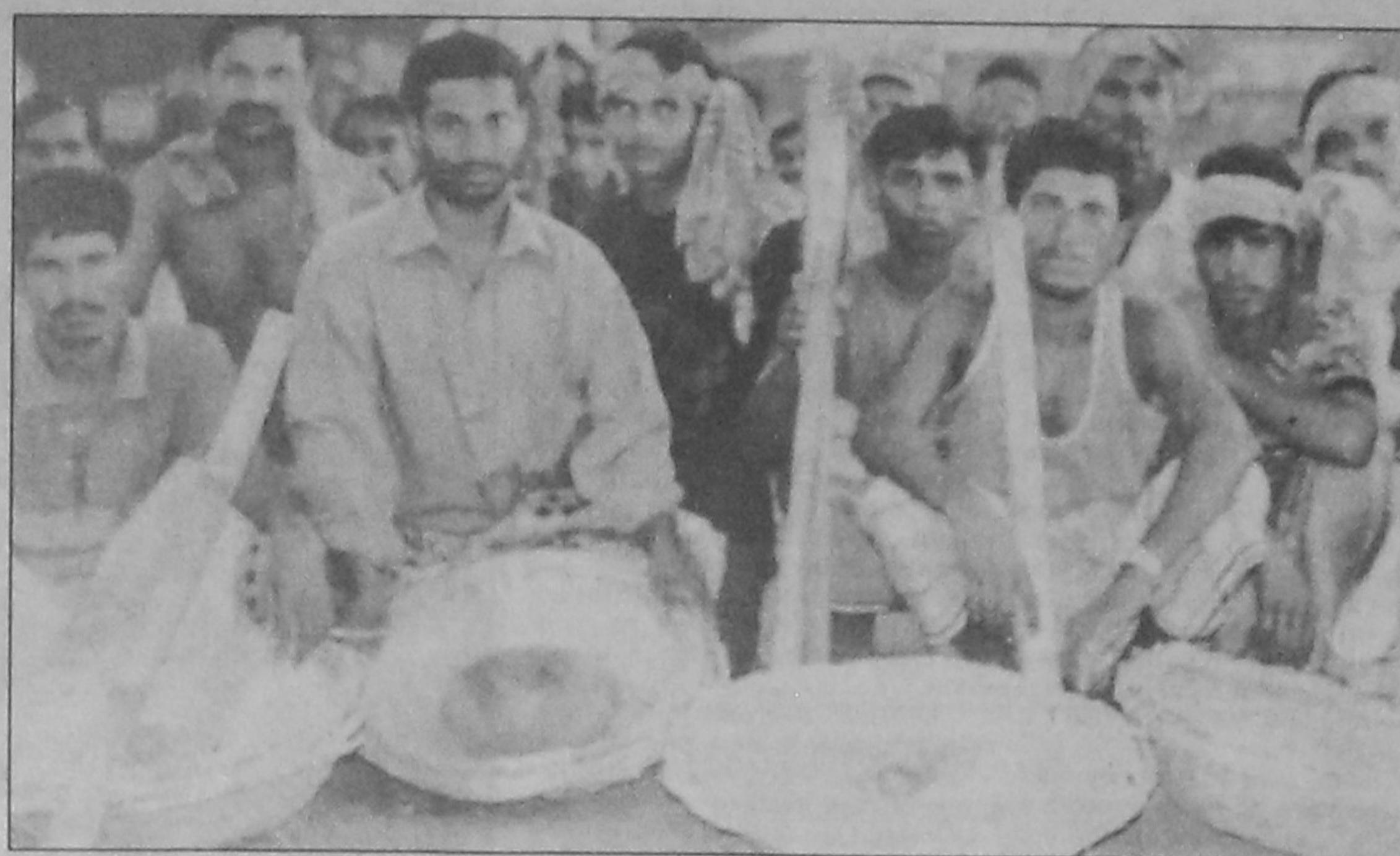
The day labourers in Magura district have been passing very hard days due to non-availability of any type of odd job. Most often they spend time starving or half-fed. Some day labourers are seen waiting near Ramnagar bazaar in Sadar upazila of the district for any odd job from morning till mid-day, but in vain.

Police said Nurul Alam, 27, was arrested from his house with some important papers upon a complaint lodged by locals.