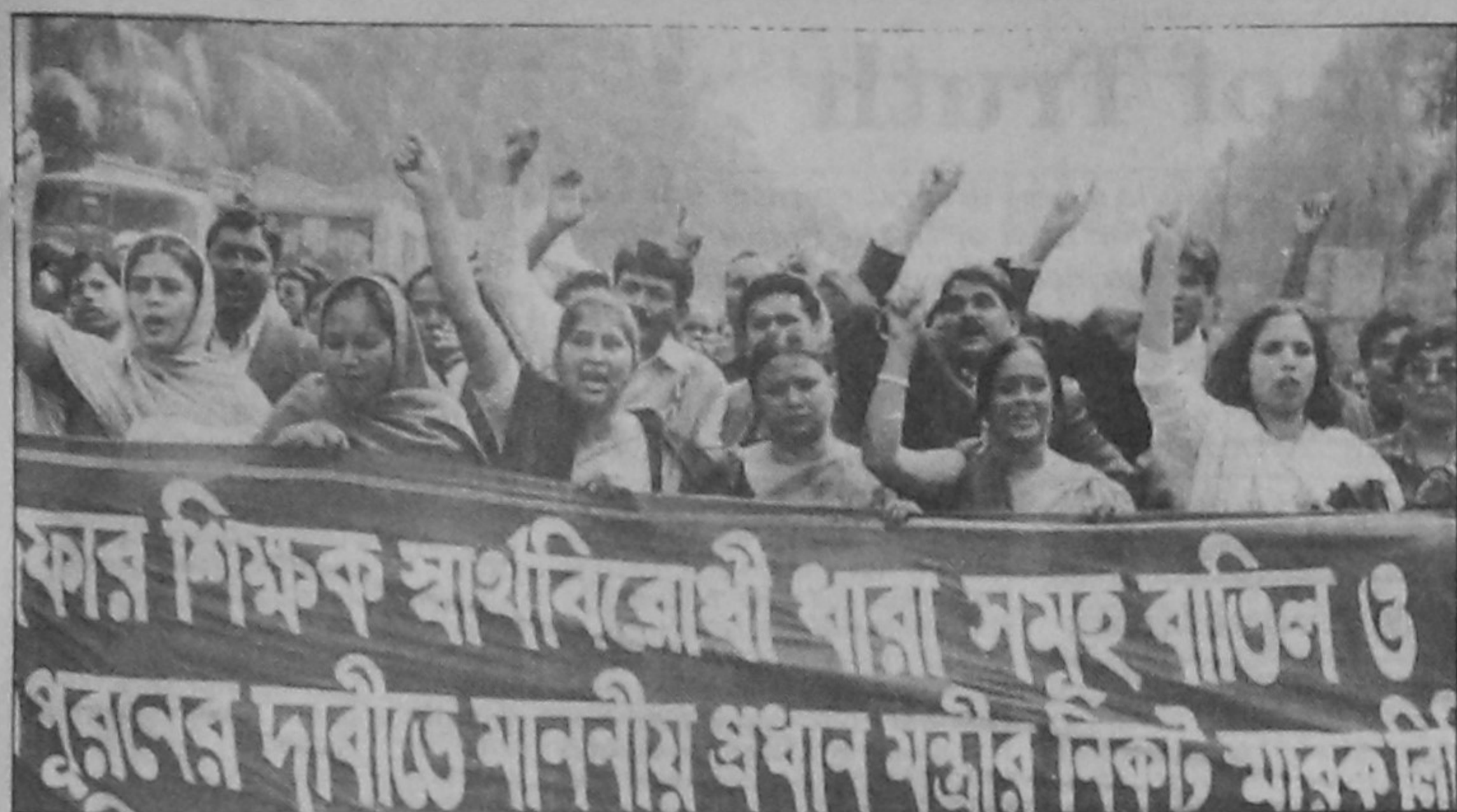
Shikhhak Karmachari Oikya Jote brought out a procession in the city yesterday prior to submission of a memorandum to the Prime Minister. They were pressing for their various demands.