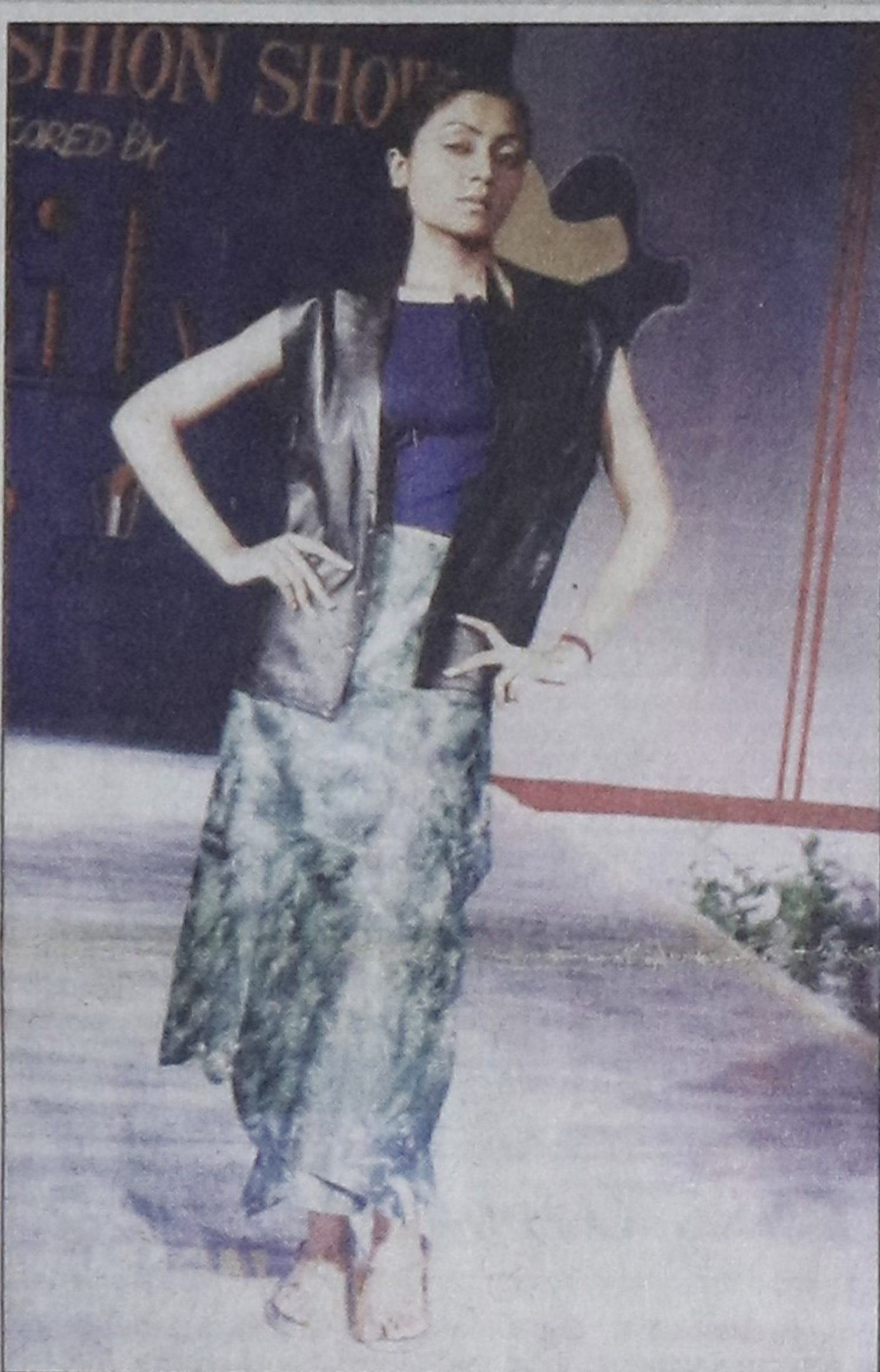
A model shows off a leather jacket during a fashion show, organised by Model Watch as part of the Dhaka International Leather Fair 2001, at Sonargaon Hotel yesterday.

Dutch-Bangla Bank Limited Your Trusted Partner