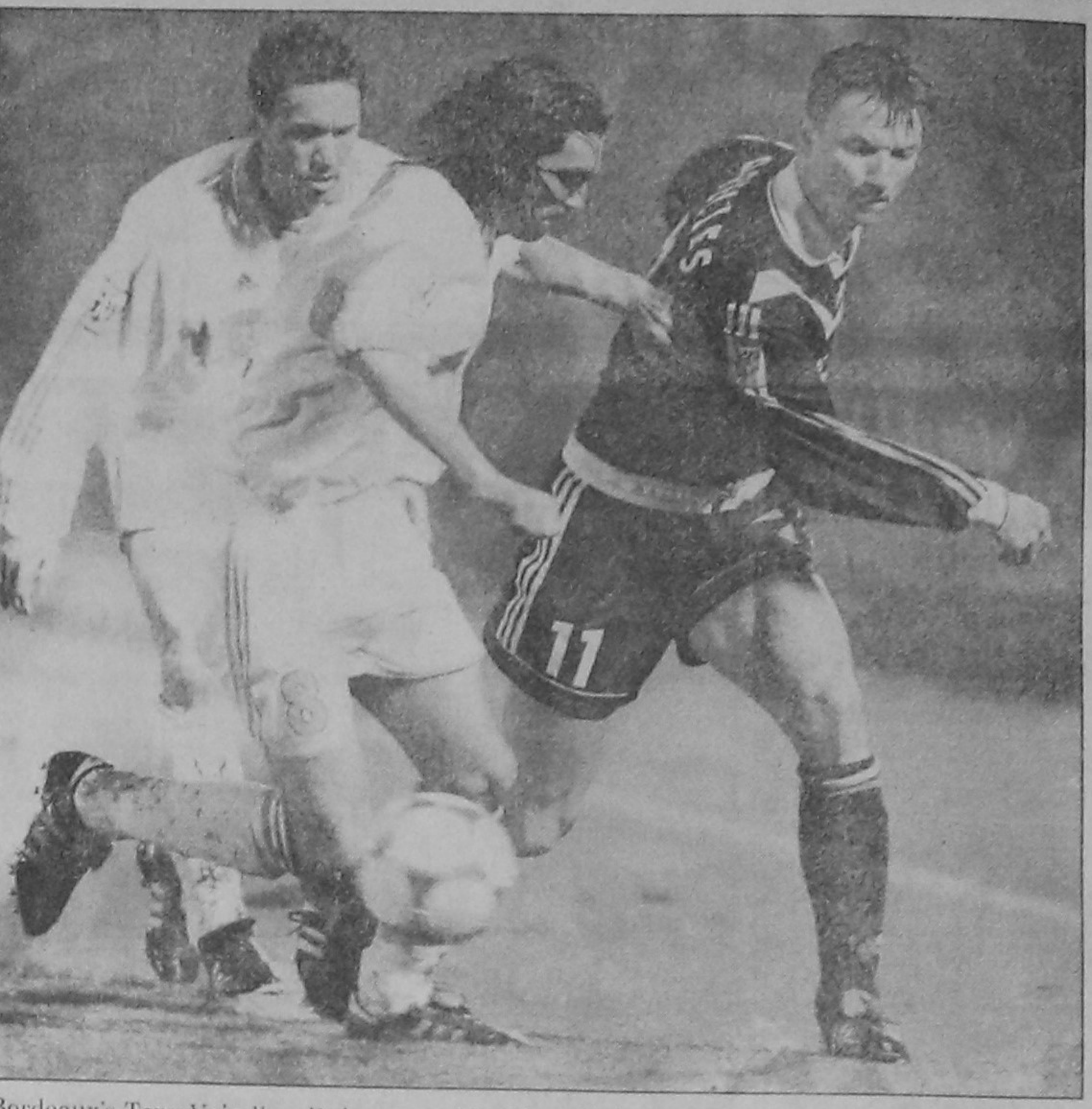
Bordeaux's Tony Vairelles (R) is pursued by Marseille's Frederic Brando in their French First Division encounter on January 26.

Cacapa, 24, joins the French First Division outfit from Brazilian side Atletico Mineiro on loan for six months while Loko signed for the remainder of the season.