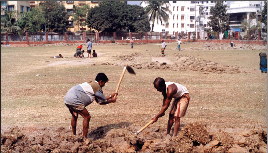
Work is on in full swing to convert the Banani Park and Playground at Kemal Ataturk Avenue into a 'green park with walkways and seasonal plants.' Rajuk has undertaken the scheme to protect the open space from possible illegal occupation.