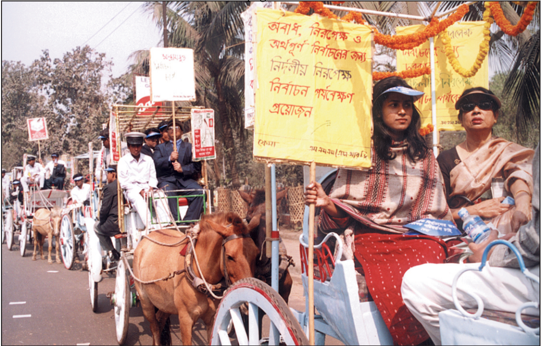
Members of the Fair Election Monitoring Alliance brought out a phaeton rally in the city yesterday with a call for non-partisan and neutral monitoring to ensure free and fair elections.