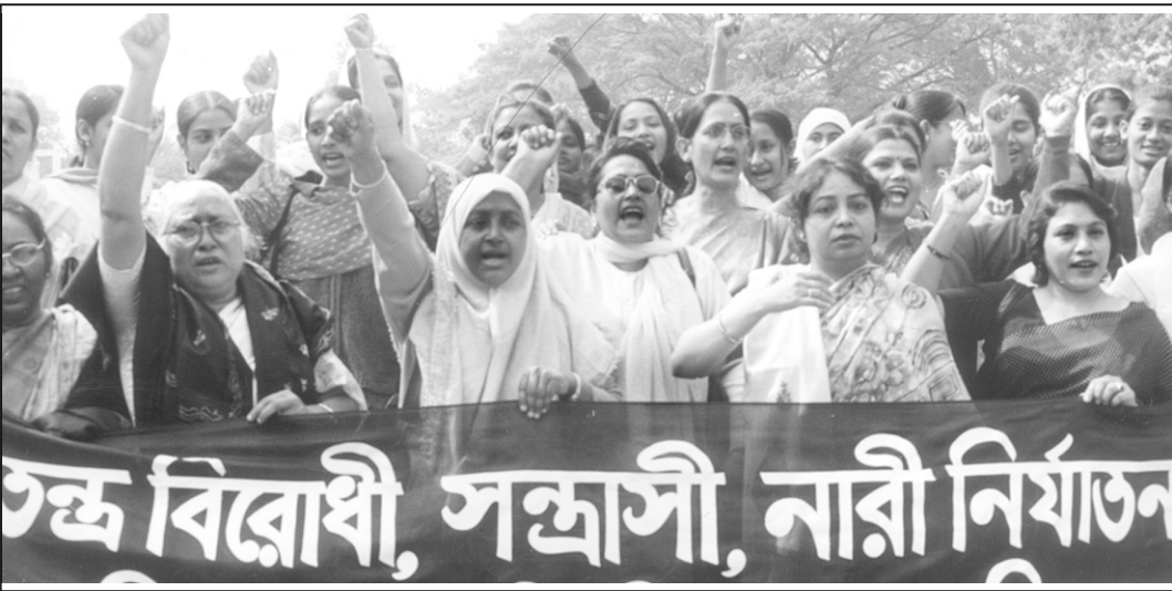
Bangabandhu Mahila Parishad staged a demonstration at the Central Shaheed Minar yesterday to protest terrorism, repression of women and anti-democratic activities in the country.

because of the many after-shocks." Damage was also severe in Ahmedabad, where 40 to 50 high-rise buildings collapsed. In one building, a four-story elevator shaft remained intact, while the apartments around it came down in a heap. Some 14,000 people, mostly suffering broken bones and cuts, jammed hospitals. Survivors sifted through the surface of the rubble, looking to salvage belongings or to hear possible sounds from their still-buried loved ones. Rescue workers, equipped with little more than crowbars or pickaxes, dug through the debris. A few bulldozers were deployed. Some people crept up the twisted stairwells to pack valuables into suitcases and baskets, lowering them by rope to the ground. But most people were too afraid to re-enter the shaking buildings. They slept in the street around campfires with temperatures at 13 degrees Celsius (55 F).