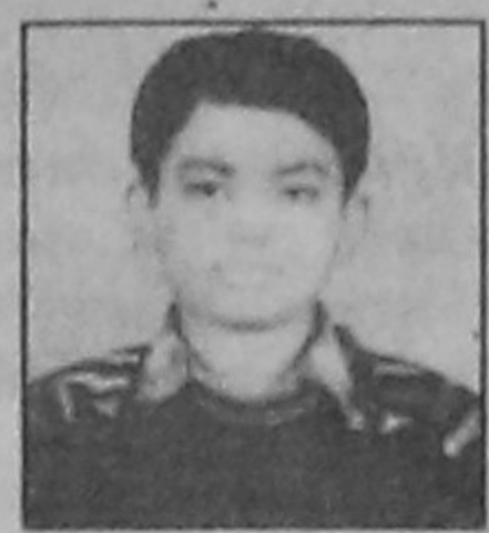
Father, Mother, Brothers & Sisters C-143