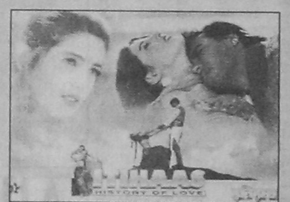
Star Mast Movies: Itihaas (Ajay Devgan, Twinkle Khanna) on Star Plus tonight at 8:30

Pappyland/Buddy Bear/Turtle Lou 6:30 Open Sesame 7:00 Open Sesame 7:30 The With & The Warrior 8:00 The Return of Granamyr 8:30 Bravestarr/ The Wrong Hands 9:00 Achie and Sabrina Surprise Package 9:30 Construction Site II /Space Invaders 10:00 Make Yourself at Home 10:30 Secret World of Alex Mack, The II/Pressure 11:15 Children of the Dust 1:00 Rehearsal for 5:30 Sally Hemings An American Scandal (2 Parts) 7:30 Sally Hemings An American Scandal (2 Parts)/Neil Simon's The Sunshine 9:30 Boys 11:15 Sarah, Plain and Tall 1:15 Sally Hemings: An American Scandal (2 Parts) 3:00 Sally Hemings An American Scandal (2 parts) 5:00 Poppatop's Shop 5:30 Pappyland /Eloise & Elmer