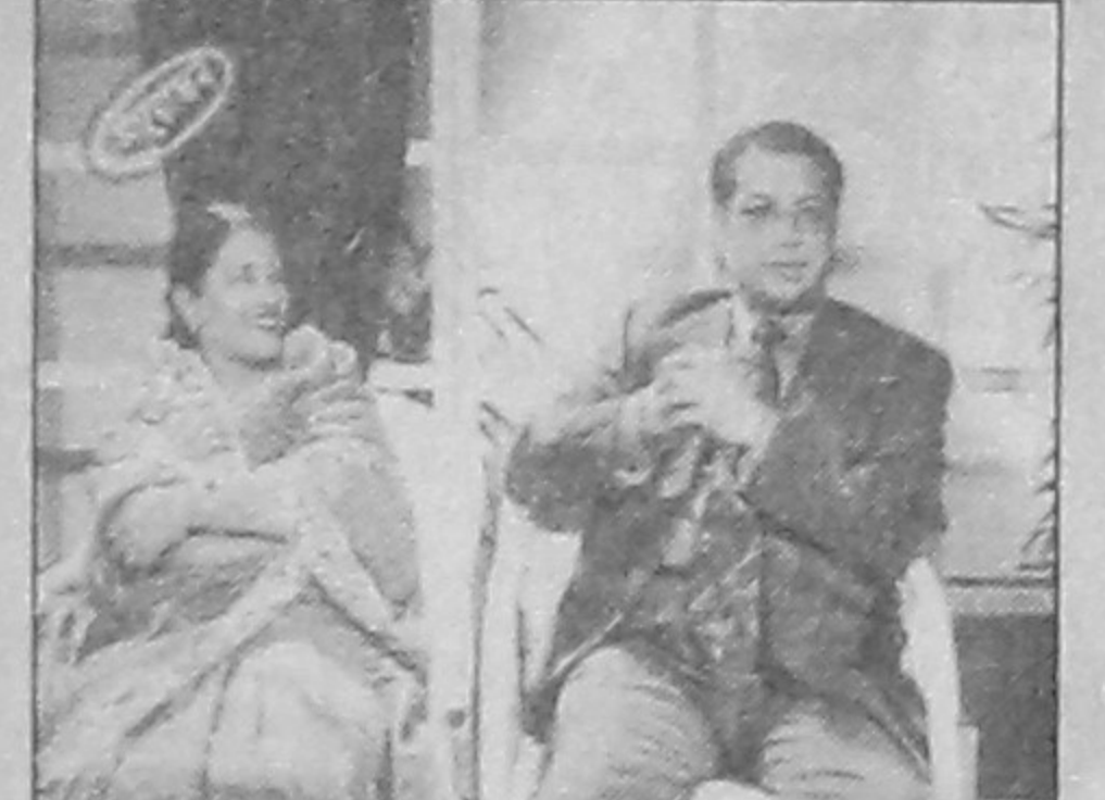
Magazine programme Ayojon on ATN Bangla tonight at 9:35