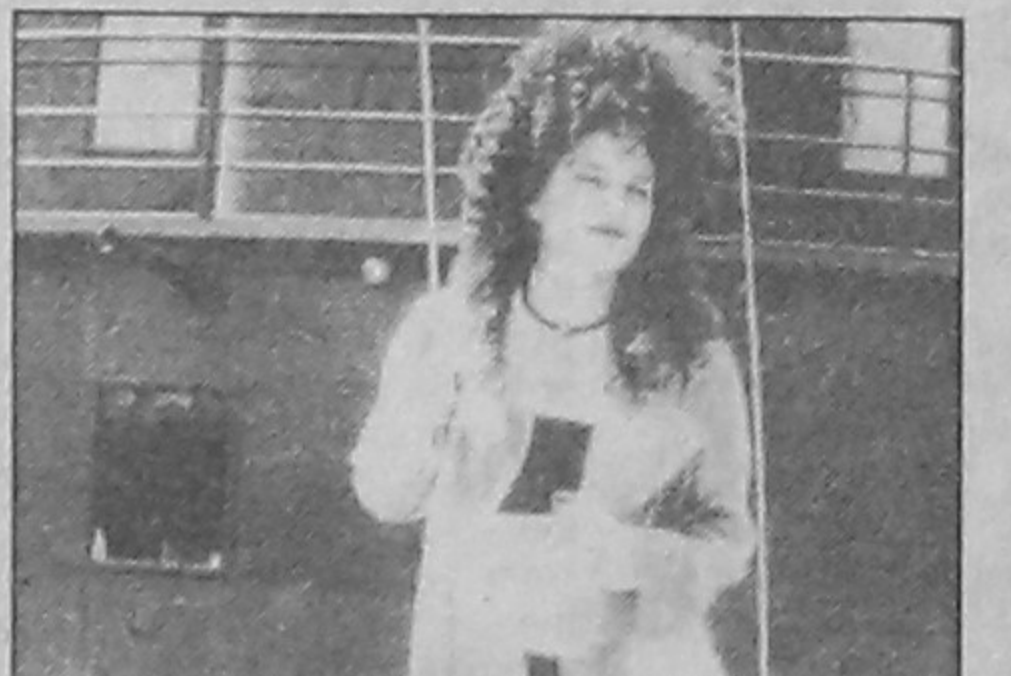
Earth Final Conflict on BTv today at 7:25 in the evening

6:00 The Adventure of Sinbad 7:00 The Simpsons 7:30 Things People Do 8:00 The Bold & The Beautiful 10:00 TV Com. 10:30 Travel Asia 11:00 Fox Kids Goosebumps 1:00 World Championship