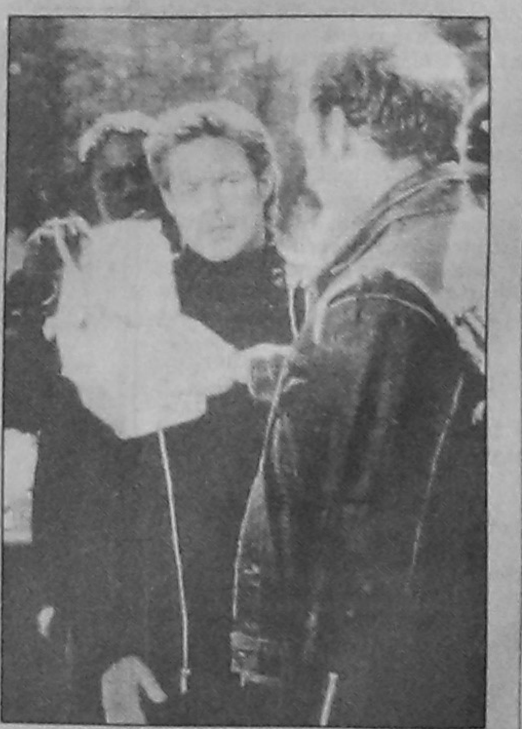
First Wave on Star World tonight at 11

Pappyland/Buddy Bear/Turtle Lou 6:30 Open Sesame 7:00 Open Sesame 7:30 The With & The Warrior 8:00 The Return of Granamyr 8:30 Bravestarr/ The Wrong Hands 9:00 Achie and Sabrina Surprise Package 9:30 Construction Site II /Space Invaders 10:00 Make Yourself at Home 10:30 Secret World of Alex Mack, The II/Pressure 11:15 Children of the Dust 1:00 Rehearsal for 5:30 Sally Hemings An American Scandal (2 Parts) 7:30 Sally Hemings An American Scandal (2 Parts)/Neil Simon's The Sunshine 9:30 Boys 11:15 Sarah, Plain and Tall 1:15 Sally Hemings: An American Scandal (2 Parts) 3:00 Sally Hemings An American Scandal (2 parts) 5:00 Poppatop's Shop 5:30 Pappyland /Eloise & Elmer