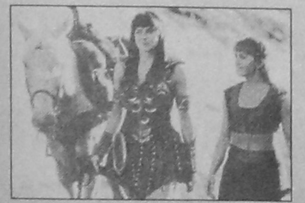
Xena on Star World at 5:00p.m.

6:15 Special Programme 6:50 Akattorer Dinguli 7:00 Drama: Taka 7:40 Flop Show.. 8:00 Din Protidin 9:00 Bibi-Ar Sawpno 9:30 Drama: