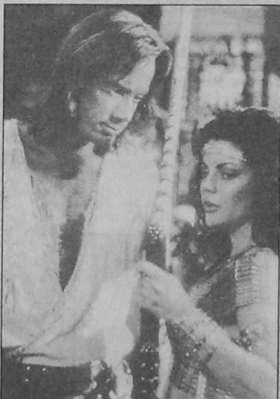
Hercules on Star World at 4:00p.m.

World News 11:30 Science and Technology Week 12:00 World News 12:30 CNN Hotspots 1:00 World News 1:30 World Sport 2:00 World News 2:30 Style with Elsa Klensch 3:00 Larry King Live (replay) 4:00 World News 4:30 CNNdotCOM 5:00 World News 5:30 World Sport 6:00