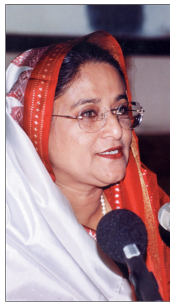
Prime Minister Sheikh Hasina addressing a press conference in the city yesterday.

Detective Branch (DB) police in the city said they came to know that Sumon was hiding in Comilla. A DB team then conducted search at several places in the district, including the house of a Union Parishad See page 11 col 7