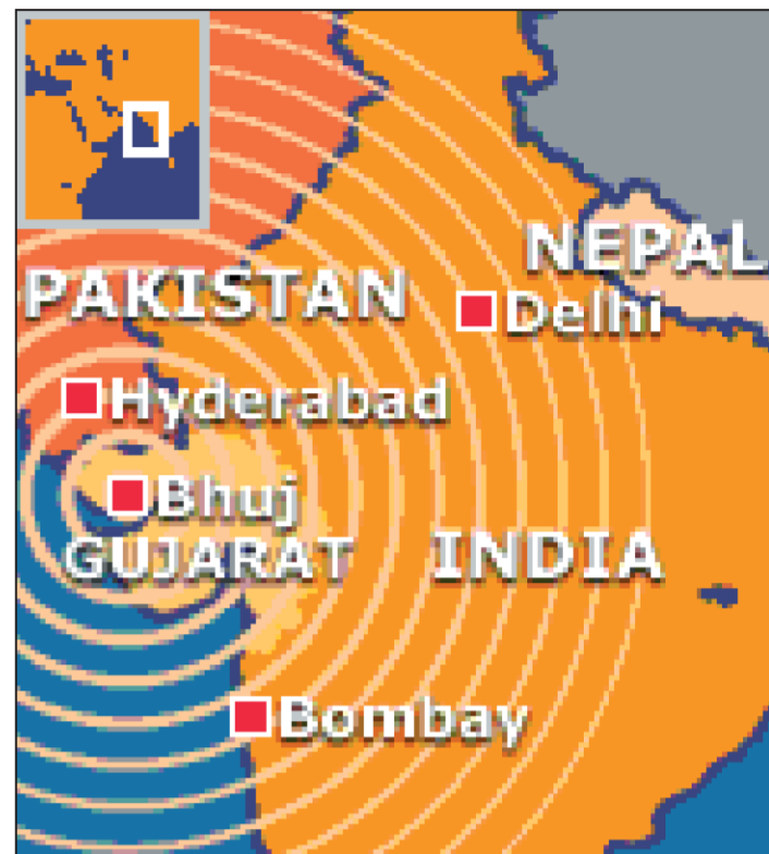
The epicentre was near Bhuj, Gujarat.

Mahajan said 90 per cent of the houses in Bhuj had been damaged. See page 11 col 4