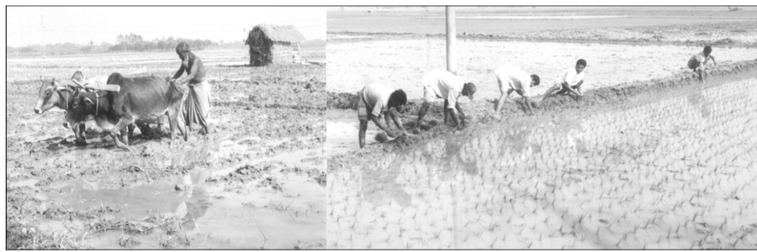
Flood affected farmers of Jhenidah district are determined to recoup the loss of last year's flood. (L) Now they are busy preparing field and (R) transplanting Boro saplings in their fields.

Acting on a tip-off, a team of police raided a furniture shop in the area at about 4:30 am and arrested its owner, Khandaker Mosharrar Hossain with 18 guns, four rounds of bullet and arms-making equipment. The shop was used in making arms since long. Khandaker Hossain has long been making arms and selling those to the terrorists in different parts of the district in the name of dealing in furniture, police said. A case was filed.