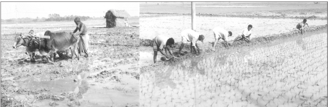
Flood affected farmers of Jhenidah district are determined to recoup the loss of last year's flood. (L) Now they are busy preparing field and (R) transplanting Boro saplings in their fields.