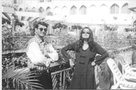
Tele-film Chaya Prem on Ekushey television tonight at 8

3:00 Opening Announcement 3:20 Open University 4:00 Khabar 4:05 Cartoon: Bumy and Friends 4:30 Ta Ta Tho! Tho! Dancelesson for the children 5:00 School Debate competition 5:50 Dharma O' Jivan 6:00