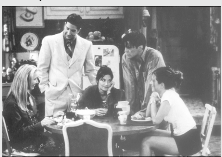
Friends on Star World at 9:00 tonight.

6:00 Dark Skies/The Warren Omission 7:00 I Dear You 8:00 Cyberteam in Akibaban/Flame of Recca 9:00 Slam Dunk /Samurai X 10:00 Charlie's Angels/I Will Be Remembered 11:00 I Dare You 12:00 VIP/Dr Strangeval 1:00 Who Dares Wins 3:00 Who Dares Wins/Cyberteam in Akibaban 4:00 Flame of Recca/Slam Dunk 5:00 Samurai X /Who Dares Wins 6:00 Action Heroes 7:00 Beastmaster II 8:00 Movie: The Fourth Floor 10:00 Charlie's Angels/I Will Be Remembered 11:00 Beastmaster II 12:00 Movie: The Fourth Floor 2:00 Dark Skies/The Warren Omission 3:00 Silk Stalkings IV /Divorce Palm Beach Style