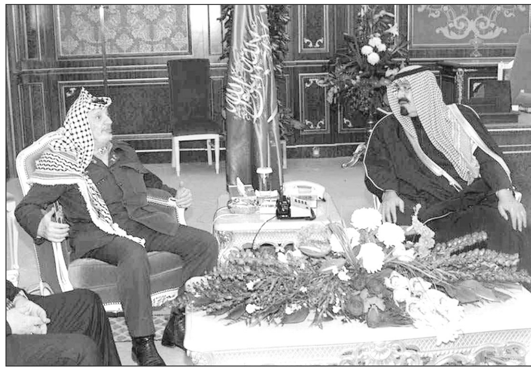
Palestinian leader Yasser Arafat (L) meets with Saudi Arabia's Crown Prince Abdullah bin Abdul Aziz in Riyadh on Tuesday. Arafat later met with Saudi King Fahd to discuss the Middle East peace process and bilateral relations. Israel decided to suspend the Israeli-Palestinian peace talks that were being held in the Egyptian Red Sea resort of Taba until after the funerals of two Israelis killed in the West Bank town of Tulkarem.

"I don't think there is any possibility of reaching an agreement in three days or in the coming 10 days during the negotiations in Taba," Palestinian negotiator Saeb Erakat told Voice of Palestine radio Tuesday.