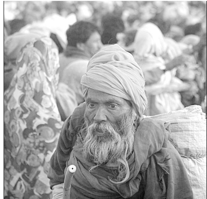
A Hindu holy man make his way back from the Sangam (background), as hundreds of thousands of devotees waited to bathe yesterday during the Kumbh Mela. Thousands of holy men and their disciples bathed at the Sangam, where the waters of the Yamuna and the Ganges meet, on the most sacred day of the world's largest religious gathering. Some 20 Million Hindu devotees were expected to bathe on the day.