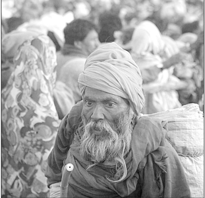
A Hindu holy man make his way back from the Sangam (background), as hundreds of thousands of devotees waited to bathe yesterday during the Kumbh Mela. Thousands of holy men and their disciples bathed at the Sangam, where the waters of the Yamuna and the Ganges meet, on the most sacred day of the world's largest religious gathering. Some 20 Million Hindu devotees were expected to bathe on the day.

the most revered of sadhu (Hindu sage) sects, marching in colourful processions from about 5:15 am Wednesday (5:45 BST Tuesday). The first to bathe at 5:45 am (6:15 BST) were 1,000 Nagas from the "Maha Nirvani" sect, who threw off their marigold garlands and charged naked and shouting into the waters at the sacred "Sangam" -- the confluence of the Ganges, the Yamuna and the mythical Saraswati rivers. The group included both the dreadlocked older Nagas and shaven-headed initiates, who were taking their first plunge after their initiation into the sect. In sharp contrast to the pomp and drama surrounding the bathing of the Nagas was the picture of the millions of ordinary Hindus, who make up the vast majority at the 12-yearly Maha Kumbh fair, taking a dip in the Ganges. Hundreds of boats were seen ferrying devotees to the "Sangam," which has a capacity to allow 20,000 pilgrims to bathe at a time. Kumbh Mela administrator Jeevesh Nandan said at first estimates 15 million Hindu devotees had taken the soul-salvaging dip since Tuesday 7:00 pm (19:30 BST).