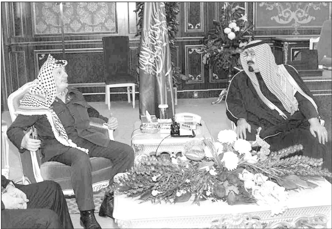
Palestinian leader Yasser Arafat (L) meets with Saudi Arabia's Crown Prince Abdullah bin Abdul Aziz in Riyadh on Tuesday. Arafat later met with Saudi King Fahd to discuss the Middle East peace process and bilateral relations. Israel decided to suspend the Israeli-Palestinian peace talks that were being held in the Egyptian Red Sea resort of Taba until after the funerals of two Israelis killed in the West Bank town of Tulkarem.

ists." "There is no miracle cure in this war, but in the end, swift action against terrorists responsible for repeated attacks represents the most effective way of dealing with them," Sneh told army radio. Arafat's Palestinian Authority condemned the killings and said it would open an investigation to track down those responsible. Even before the Taba talks were suspended, both sides had cast doubt on the prospects for an early deal, with the Palestinians speaking of deep gulfs on key issues including Jerusalem, Jewish settlements, borders and Palestinian refugees. "I don't think there is any possibility of reaching an agreement in three days or in the coming 10 days during the negotiations in Taba," Palestinian negotiator Saeb Erakat told Voice of Palestine radio Tuesday.