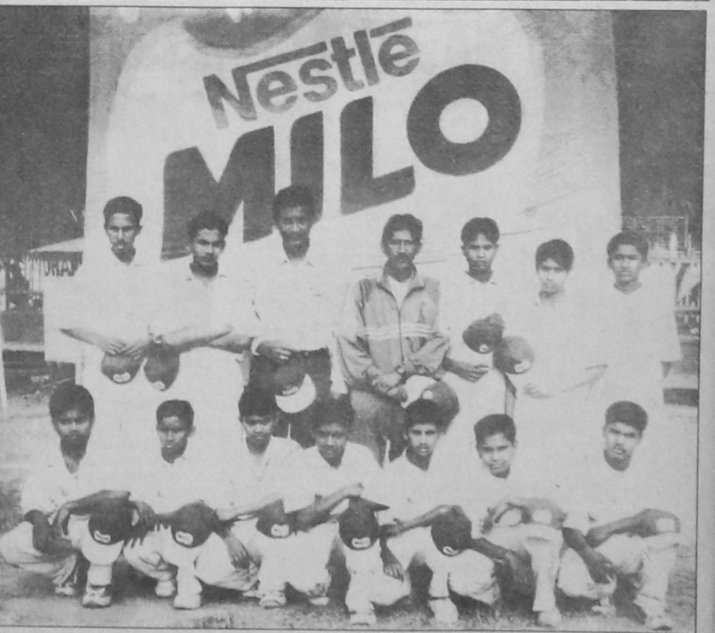
Players and officials of the Rajshahi Tista cricket team that won the Milo Under-13 final at the Dhanmondi Club ground yesterday.