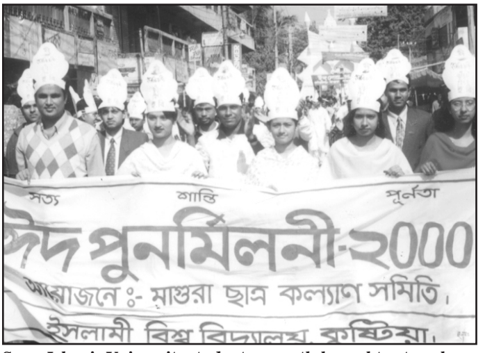
Some Islamic University students recently brought out a colourful procession in Magura town in observance of Eid reunion.