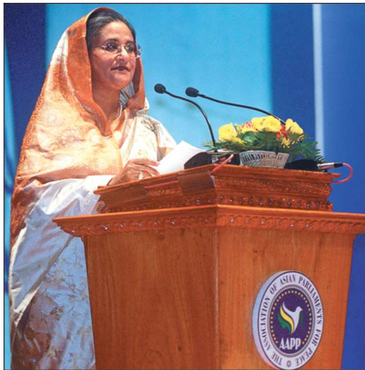
Prime Minister Sheikh Hasina delivers her speech as President of the Association of Asian Parliaments for Peace (AAPP) at the opening ceremony of the association's conference in the Cambodian capital of Phnom Penh yesterday.

AAPP chairmanship handed over to Cambodia